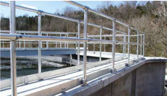
Tennessee, United States