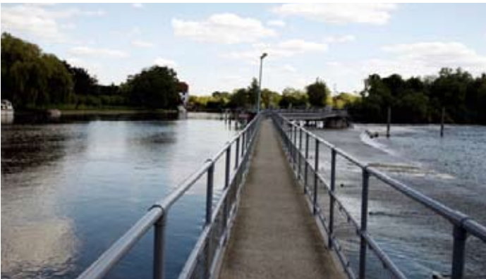
Hambledon Weir, UK