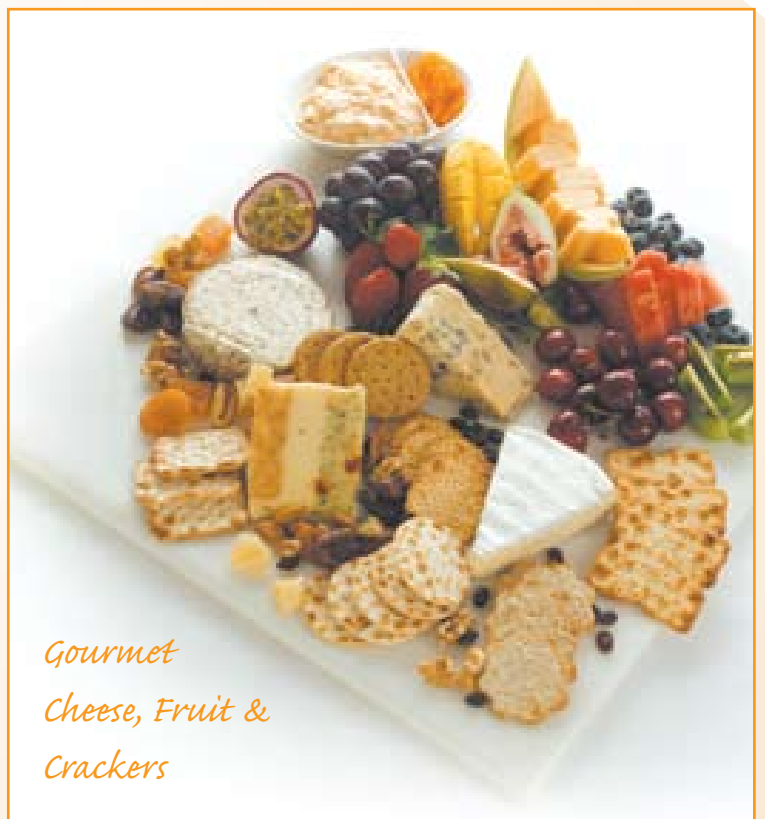
Gourmet Cheese, Fruit & Crackers

A selection of gourmet cheese with freshly sliced seasonal fruit, an assortment of crackers, dried fruit, nuts and garnish.