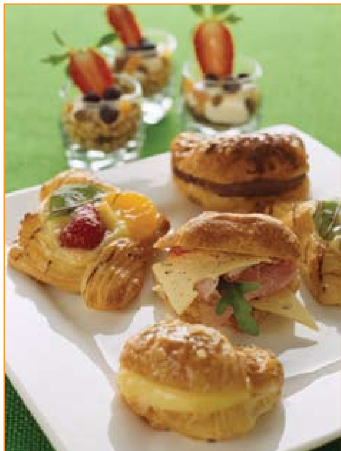
Mini Croissants and Fresh Fruit + Custard Danish

Baby Breakfast Sausages (2) Country Style Bacon Strips (1) Scrambled Eggs with Braised Mushrooms, Slow Roasted Tomatoes and Spinach (1) Crunchy Hash Browns (1) Warm French Rolls with Butter + Jam (1) An assortment of Freshly Baked Pastries (1) Fresh Fruit + Berries with a Sweet Yoghurt Dipper (1)