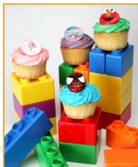
Colourful Piped Cup Cakes