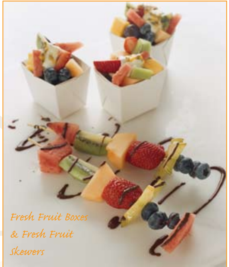
Fresh Fruit Boxes & Fresh Fruit Skewers