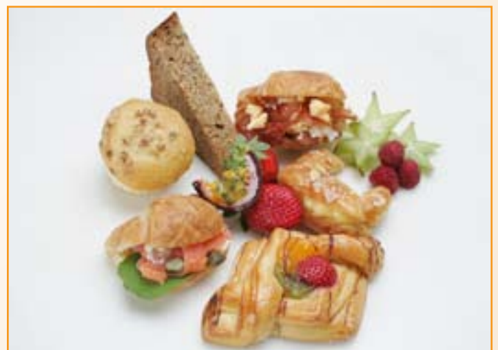
Mini Sweet & Savoury Pastries

Morning Tea Mini Sweet + Savoury Pastries (2) Lunch Char Grilled Chicken Pieces Rosemary and Spinach Potato Bake (v) Pesto Pasta with Sun dried Tomato's, Toasted Pine Nuts and Fresh Basil (v) Wild Rocket, Parmesan, Spanish Onion and Marinated Cherry Tomato's (v) Assorted Dinner Rolls with Butter Portions Afternoon Tea (delivered with Lunch) Miniature Cakes + Gourmet Cheese, Fruit & Crackers