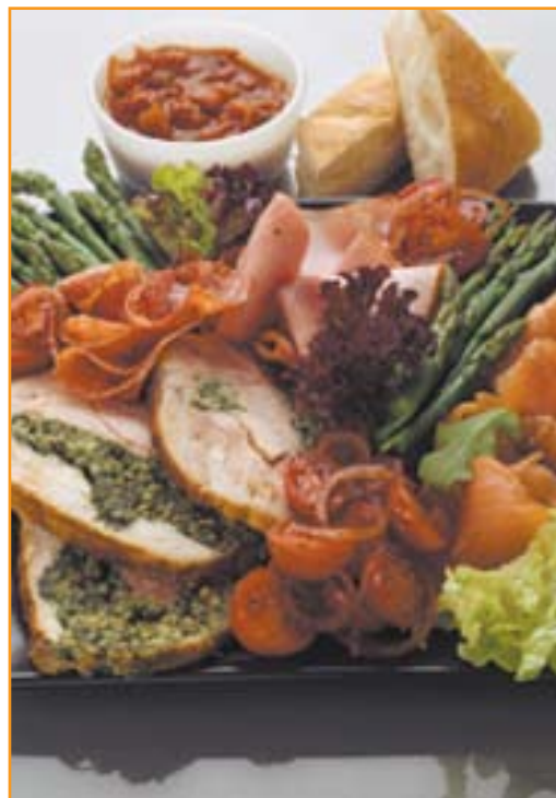
Cold meats with Bread and Dips