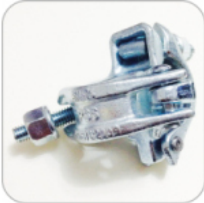
Drop Forged Double Coupler

We supply Scaffold Fittings to various Builders, Scaffolding & Mining companies. Our factories have the capability to manufacture 200 ton of Scaffold Fittings every month. We stock following Scaffold Fittings in our yard in WA.