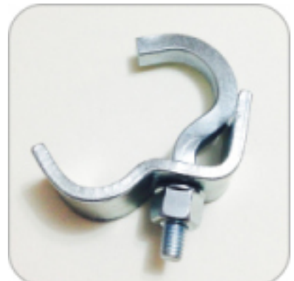
Putlog Hook Coupler