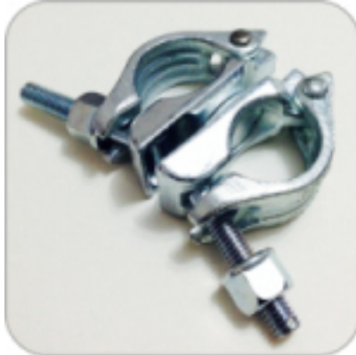
Drop Forged Swivel Coupler