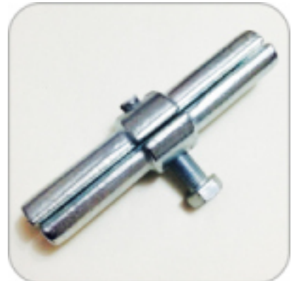
Internal Joint Pin - Forged