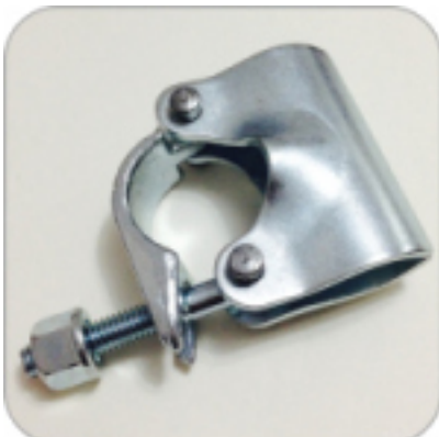
Putlog - Double Lugs