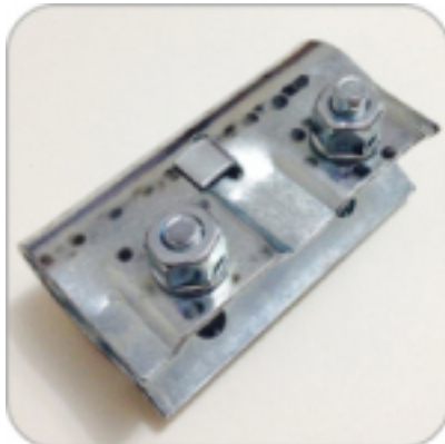
External Joint Pin / Sleeve