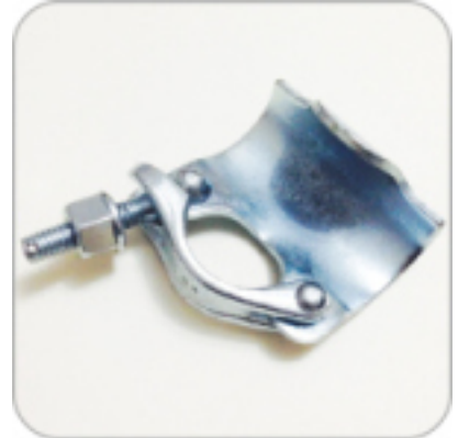
Single Putlog Coupler