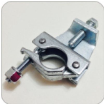
Beam Clamp / Girder Gravluk.