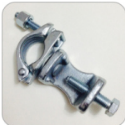
Swivel Beam Clamp