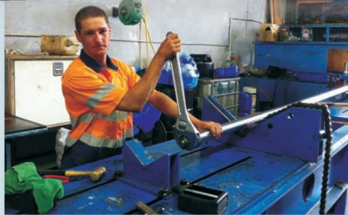
Largest Cylinder Breakdown Table North of Brisbane