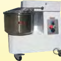
25L Spiral Mixer