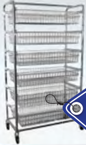
Straight 6 Basket Trolley

Chrome finished. Display products on angled 5 basket or straight 6 basket trolleys. Perfect for displaying breads at the storefront, or behind the counter.