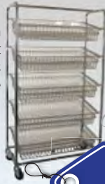
Angled 5 Basket Trolley