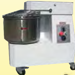
30L Spiral Mixer Now only