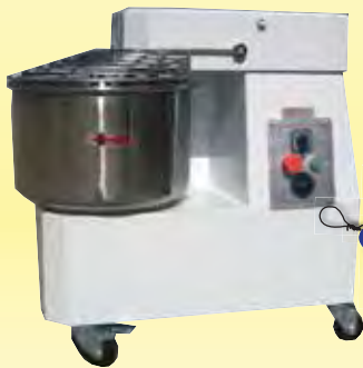
50L Spiral Mixer Now only

Maestro Mix 25, 30 & 50L Spiral Mixers Powerful chain driven motor. Safety features include safety guard incorporating safety switch. Suitable for mixing breads and pastries. Supplied with castors for easy transportation.