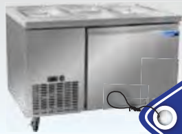
Single Door Bar