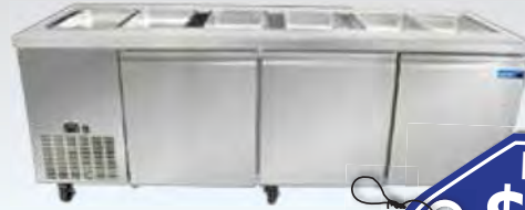
Three Door Bar

Includes adjustable shelves that suit 1/1 Gastronorm trays. Automatic defrost and the frost free design also make it very easy to maintain the unit. Ventilated cooling system allows for food to be maintained at a constant and even temperature. Pans not included.