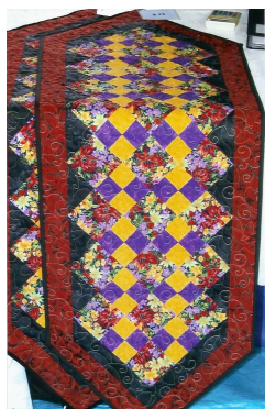
Table Runner (Beginner – Intermediate) $60.00

For those wanting kits, I have only 8 kits partially cut in lovely chocolate brown and cream fabrics which can be purchased for $55.00