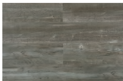
FS1634 CHATEAU OAK