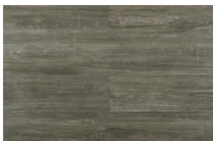
FS1638 SILVER PINE WASHED