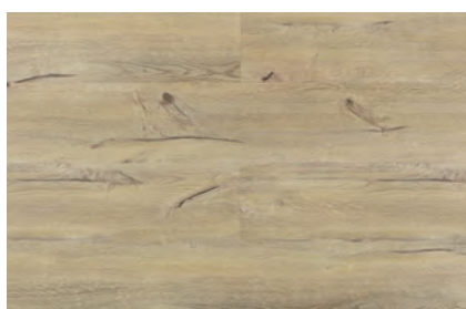
FS1643 MOUNTAIN ASH