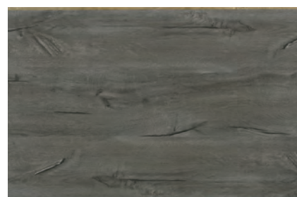
FS1642 CHARRED OAK