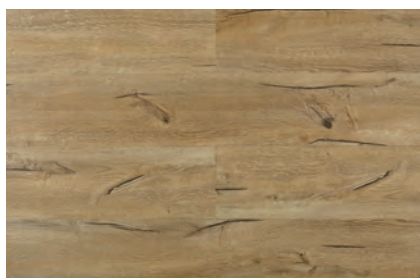
FS1641 WARM HONEY OAK