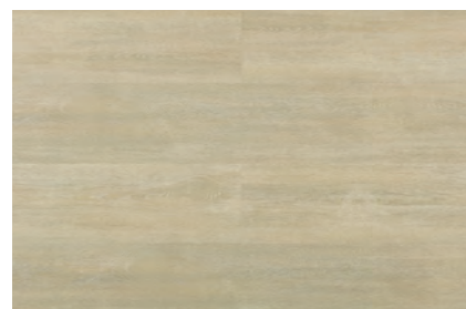
FS1635 WHITH ASH