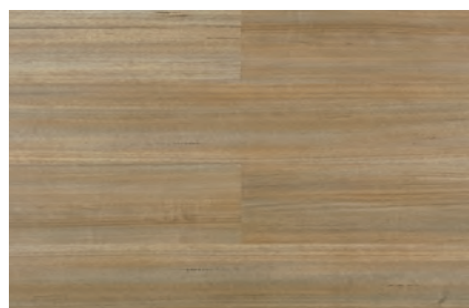
FS1644 TASMANIAN OAK