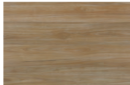
FS1640 SPOTTED GUM