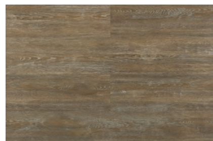
FS1637 EASTERN BLACKWOOD