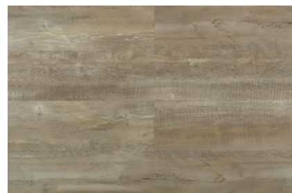
FS1631 DAINTREE SILK OAK