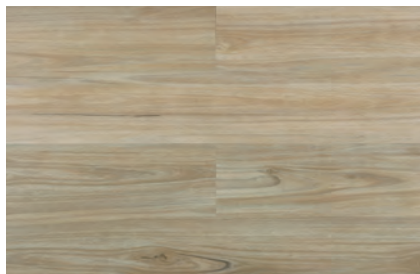
FS1639 BEECHWORTH GUM