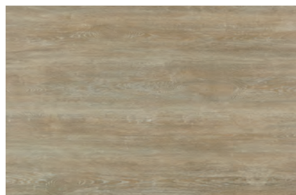
FS1636 NATURAL LIGHT WASHED