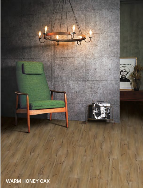
WARM HONEY OAK