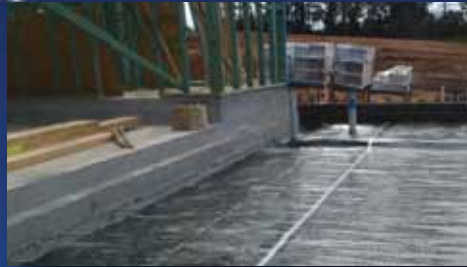
Ura-Fen Shield Full Under-slab Termite and vapour barrier

Ura-Fen shield when installed as part of a cavity perimeter system, or as full under-slab termite and vapour barrier requires no costly re-treatments.