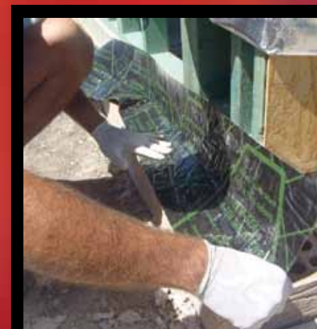
Installing Ura-Fen Shield into Cavity