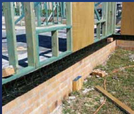
Ura-Fen Shield Side Load Cavity Perimeter