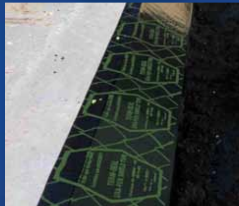
Ura-Fen Shield Top Loaded Perimeter