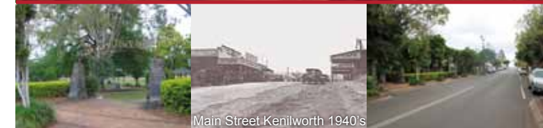
Main Street Kenilworth 1940's

Visit the Kenilworth Website at: www.kenilworth.qld.au Contact the Information Centre at 9 Elizabeth Street. Open Seven Days' 10.00am – 3.00pm Ph: (07) 5446 0122 Email: infocentre@kenilworth.org.au