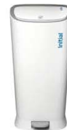
Nappy Wastebin (26l)