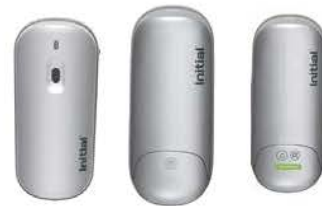
Air Fresh Aerosol Soap Dispenser Hand Sanitiser

"I do worry what visitors to the building must think seeing our kitchen when they leave, and I'm sure many of them are disappointed"