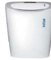
No Touch Feminine Hygiene Unit (22l)