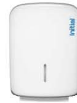
Folded Paper Towel Dispenser

Available in standard and slimline sizes