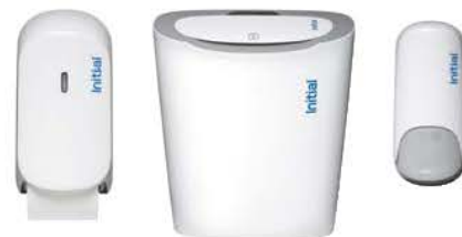
Twin Roll Toilet Paper Dispenser No Touch Feminine Hygiene Unit Toilet Seat Cleaner

"Good hygiene means nothing to hide, nothing but the highest standards"