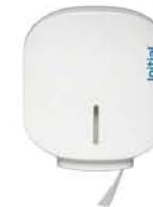
Jumbo Roll Toilet Paper Dispenser