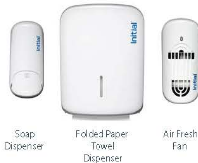
Soap Dispenser Folded Paper Towel Dispenser Air Fresh Fan