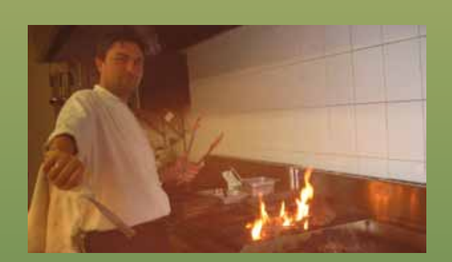
*Prices are subject to change without notice *Meals are subject to availability

Tea $3.00 Hot Chololate $4.00 Ice Coffee $4.50