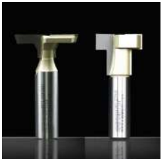
T Slot Bits