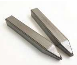
3 in 1 Alloy Steel Knife