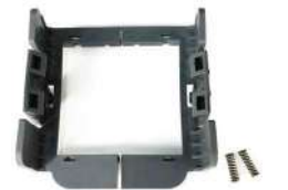
Plastic Rail Guide