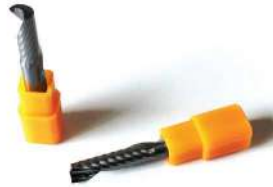
Bits for Acrylic