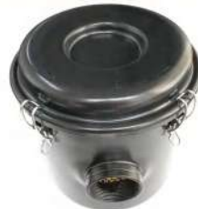
Vacuum Filter Unit