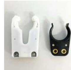
BT30 White & Black