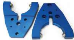
HSK63F Metal Clip