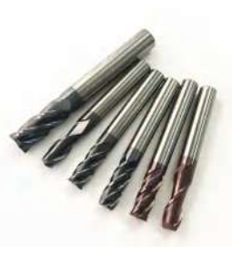
Metal Mill Bits