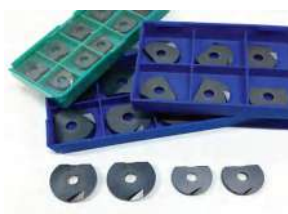
P3200 P3202 Inserts