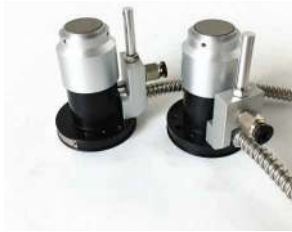
Precision Auto Tool Setter