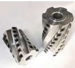
Spiral Cutter Heads