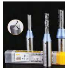
TCT Router Bits