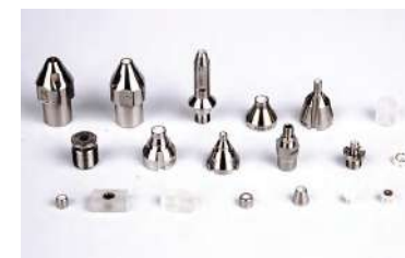
Diamond Wire Guider