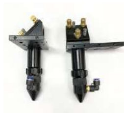
Laser Head Unit