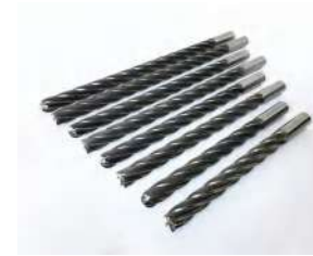
Foam Mill Bits