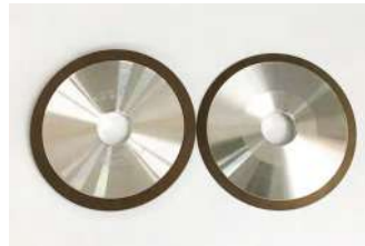
Diamond Grinding Wheels