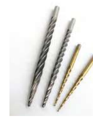
Conical Foam Bits