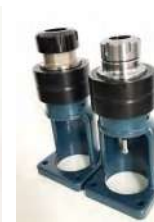
Toolholder Tighten Fixture