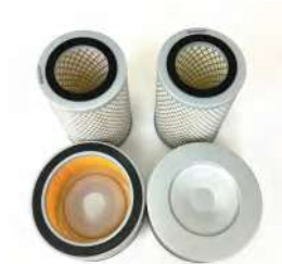
Vacuum Pump Filter