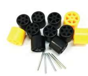
Side Beam Wheels