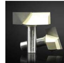
Bottom Cleaning Bits