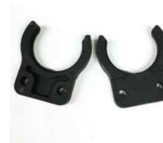
Cincinnati & Elumatec