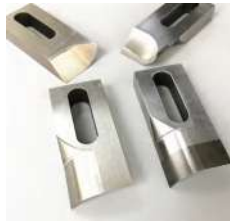
Wood Rod Cutter