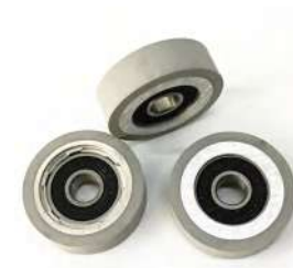
End Support Roller