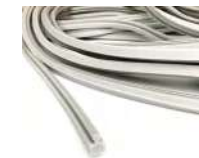
Biesse Beam Strip