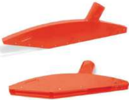
Panel Saw Dust Cover