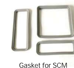
Gasket for SCM