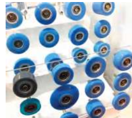
Profile Wrapping Wheels