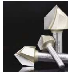
Chamfer V Bits