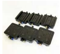
SCM Vacuum Pod