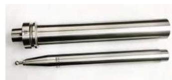
Spindle Test Bar