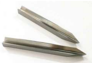
HSS Lathe Knife