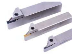
Metal Lathe Cutter