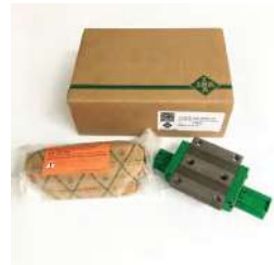
Linear Guide Block