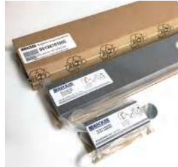
Vacuum Pump Vane