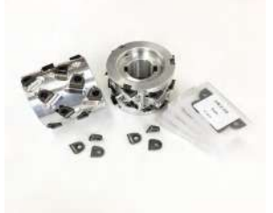
PCD Whisper Cutter