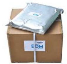
Ion Exchange Resin