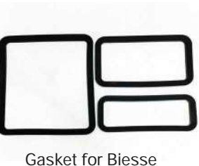
Gasket for Biesse