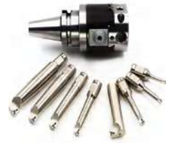
NBH2084 Boring Set