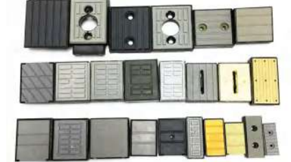
Track Chain Pads