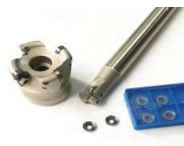
EMR Milling Tools