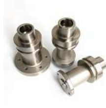
Saw Blade Tool Holder