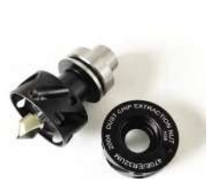
Dust Twister Nut