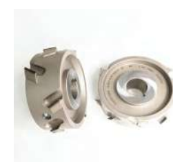
PCD Pre-milling Cutter