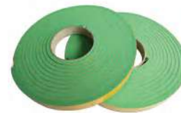
Pressure Beam Strip