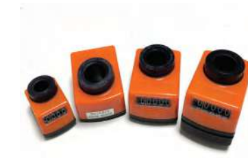
Position Display Counter