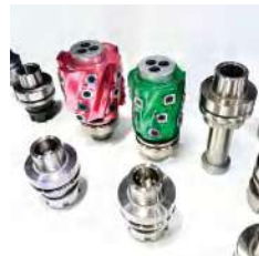
Toolholder & Cutters