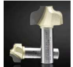
Ogee S Bits