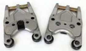
BT30 Metal Clip