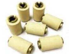
Strips Feeding Roller