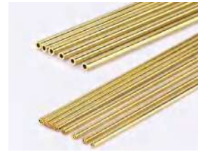
Brass Electrode Tubes