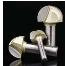
Cove Box Bits