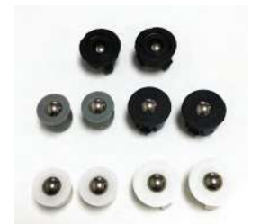
Float Table Valves