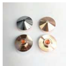
Fiber Laser Nozzle