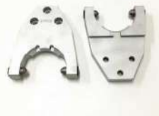
BT40 Metal Clip