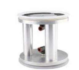
Vacuum Pod for Stone