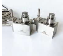
Auto Tool Setter