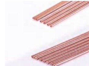
Copper Electrode Tubes