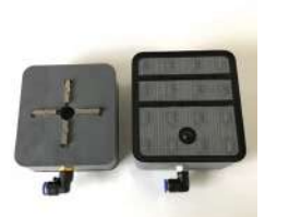
Flat Table Vacuum Pod