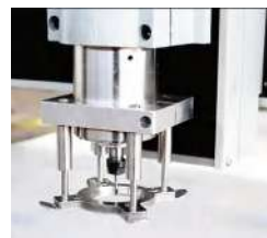
Auto Pressure Foot