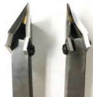
90 Degree External Knife