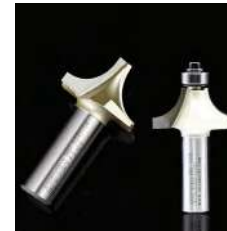
R Round Bits