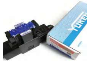
Solenoid Hydraulic Valve