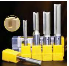
Long Straight Bits