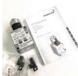
Pressure Regulating Valve