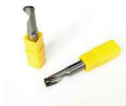
Bits for Aluminum