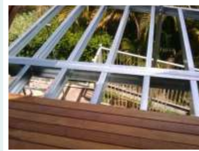
Beginning of job

P A T I O D E C K I N G R E N O V A T I O N