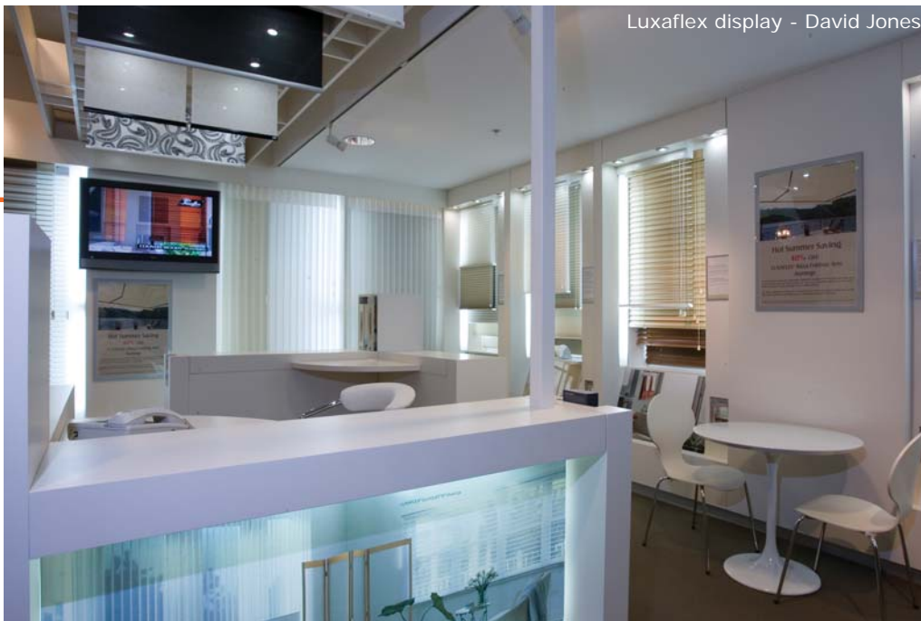
Luxaflex display - David Jones