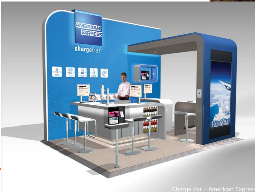
Charge bar - American Express