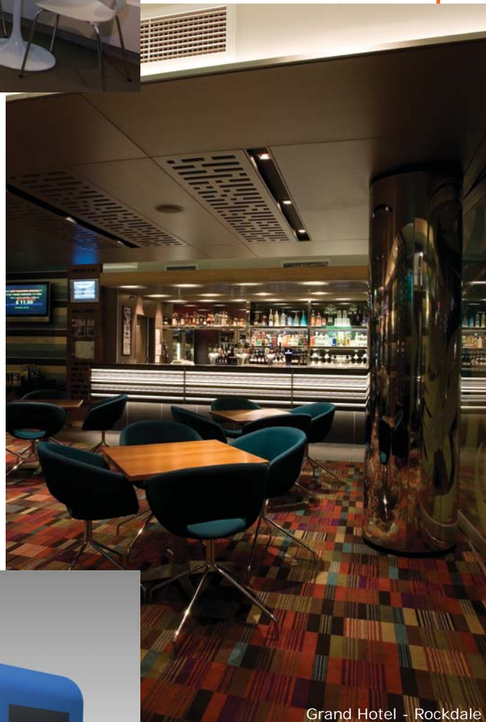
Grand Hotel - Rockdale

Currently Cloud Nine Design has completed several multimillion dollar hotel refurbishments and a retail display for Hunter Douglas in the Market Street store of David Jones. Also working as a consultant to develop an airport 'Charge bar' for American Express, examples of these are enclosed.