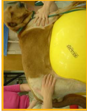
Carmel working in practice following cruciate repair surgery

There is now a service available in conjunction with your vets - bringing rehabilitation therapy- to your pets.