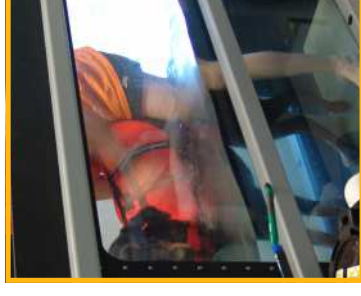
“ Barclay ” learning to walk again in the aqua-treadmill

Aquatreadmill - to provide injury specific rehabilitation, muscle strengthening, and gait training exercise.