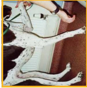
With intensive rehabilitation "Milo" regained normal use of his paw.