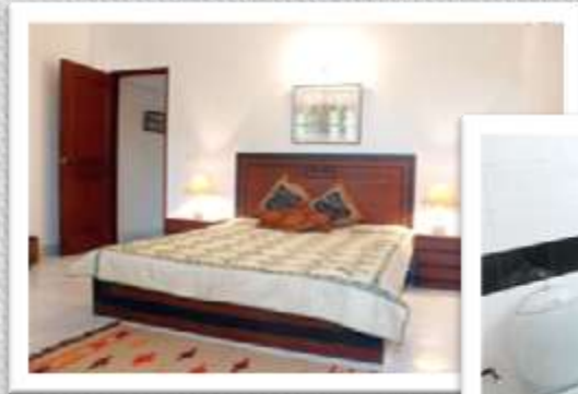
Above: Delhi Homestay