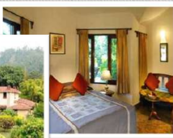
Below: Nandadevi Estate