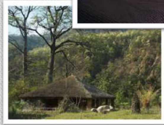
Vanghat Lodge, Corbett