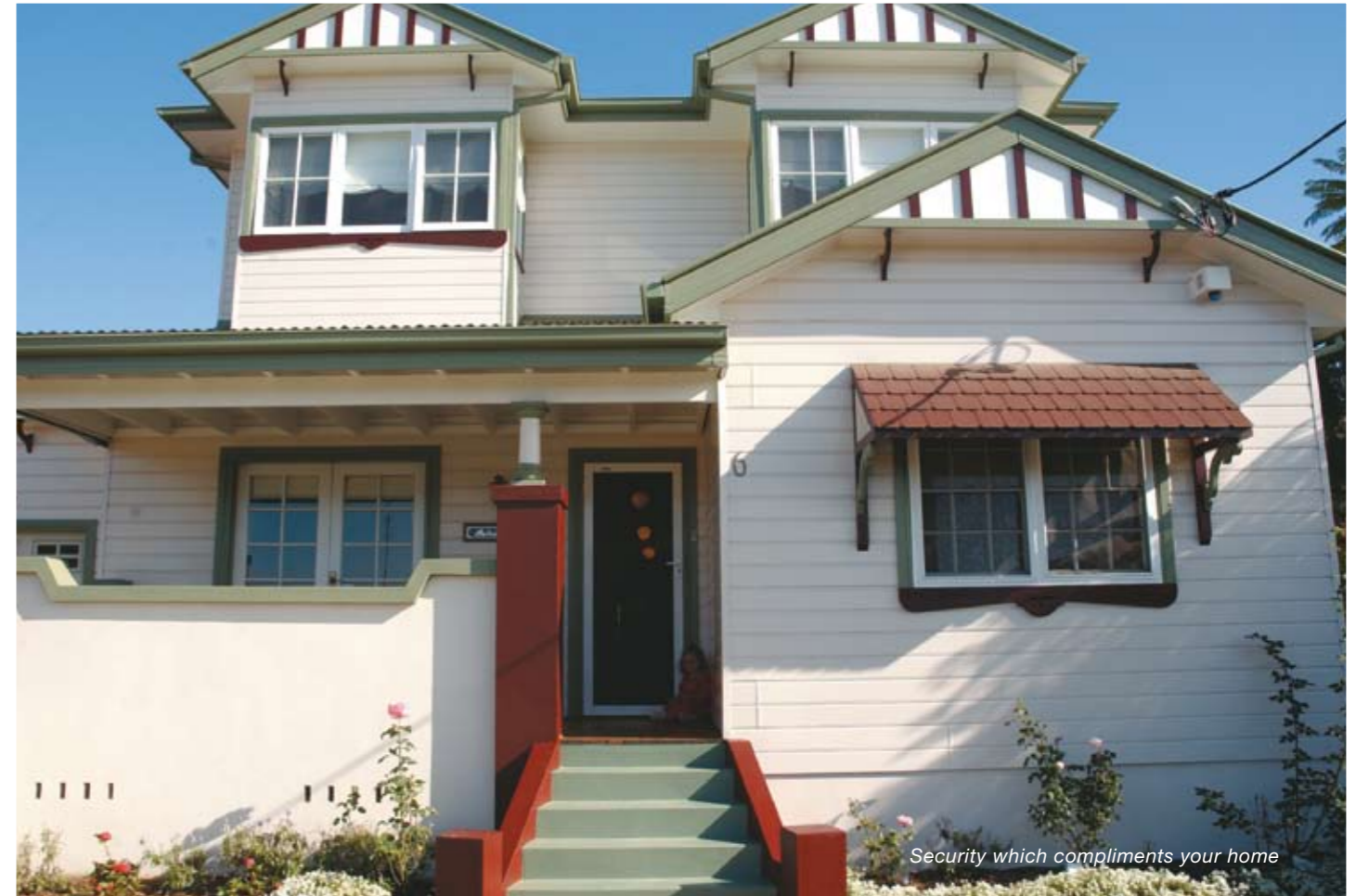
Security which compliments your home