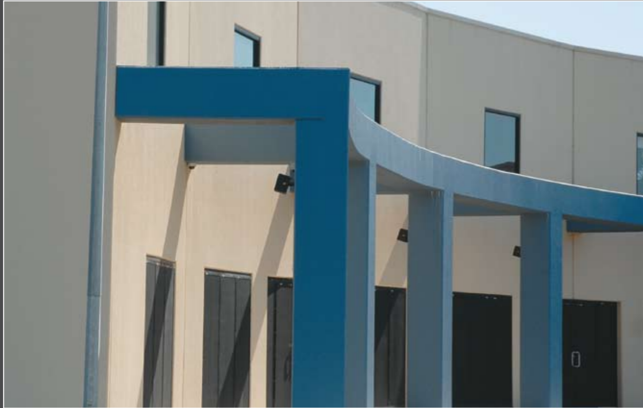
Corrosion resistant, easy to clean and discreet in appearance