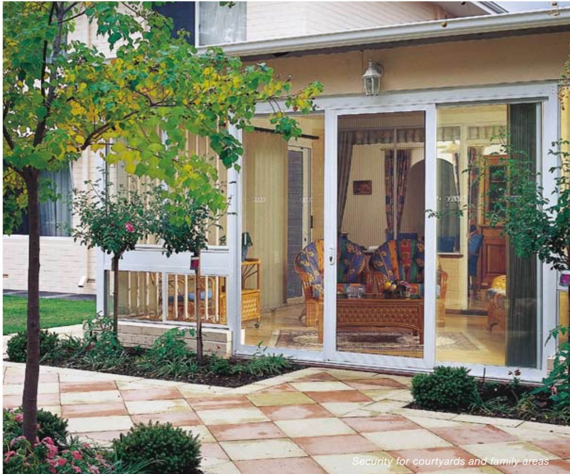
Security for courtyards and family areas