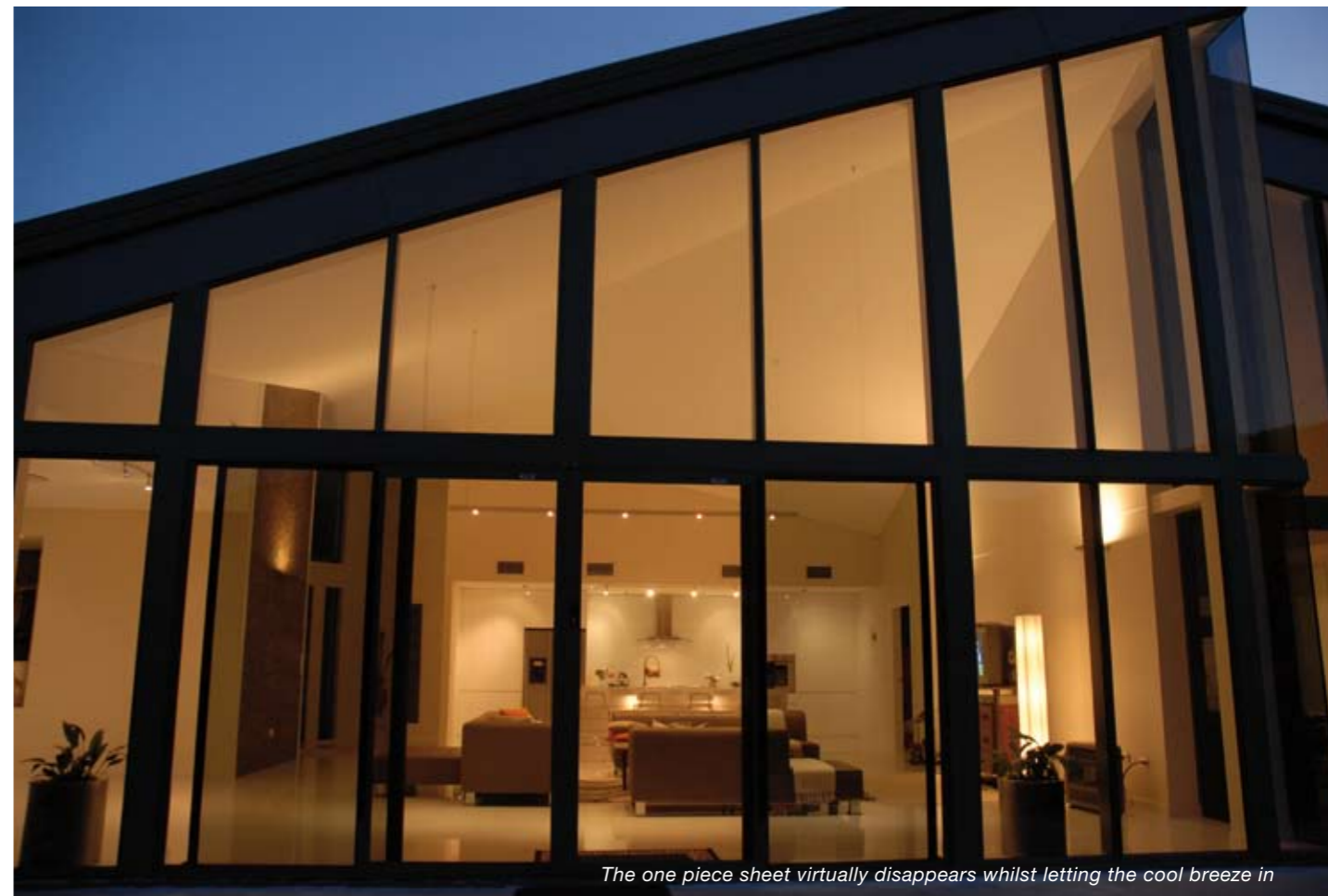
The one piece sheet virtually disappears whilst letting the cool breeze in

ClearShield screens reduce heat and glare on hot summer days. The perforations allow refreshing sea breezes through, provide superior vision out and unequalled security. ClearShield has been tested by the Window Energy Rating Scheme (W.E.R.S.) and achieved a 3.5 star rating as an energy efficient product. This equates to a reduction of up to 44% in solar heat, solar radiation and energy consumption when fitted to a window with standard 3mm glass. ClearShield is the ideal choice for energy efficient homes and for the environmentally conscious.