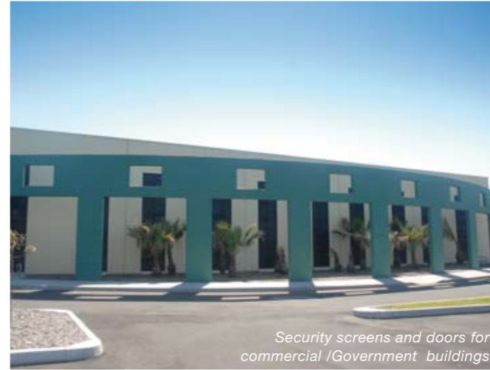
Security screens and doors for commercial /Government buildings