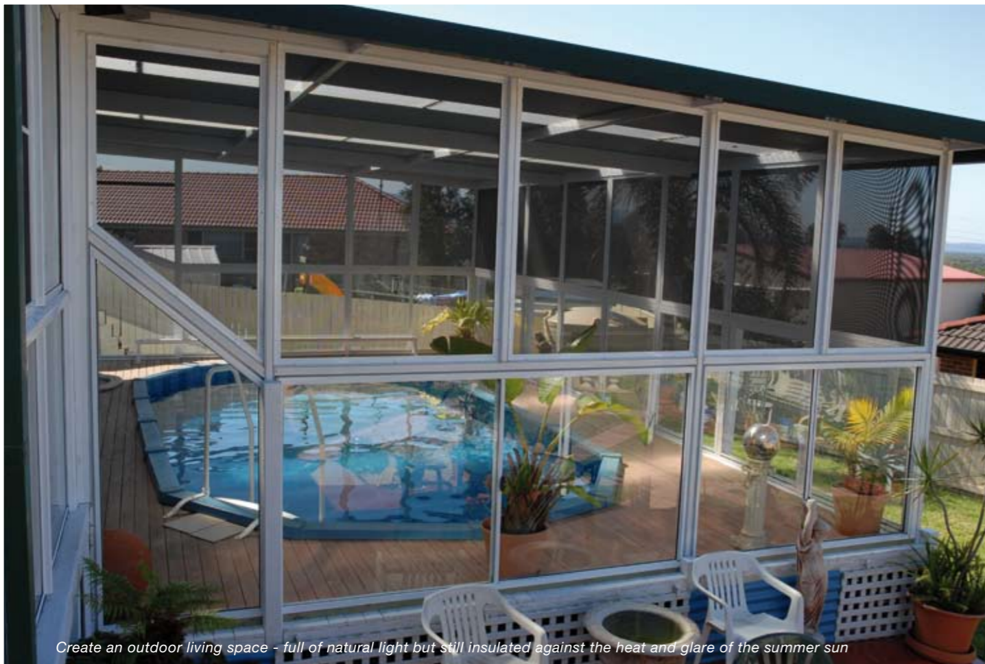
Create an outdoor living space - full of natural light but still insulated against the heat and glare of the summer sun