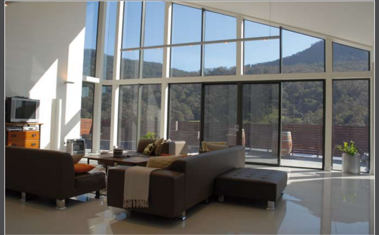
Clearshield Security Screens provide optimum visibility - great for maintaining your ocean view or hillside vista