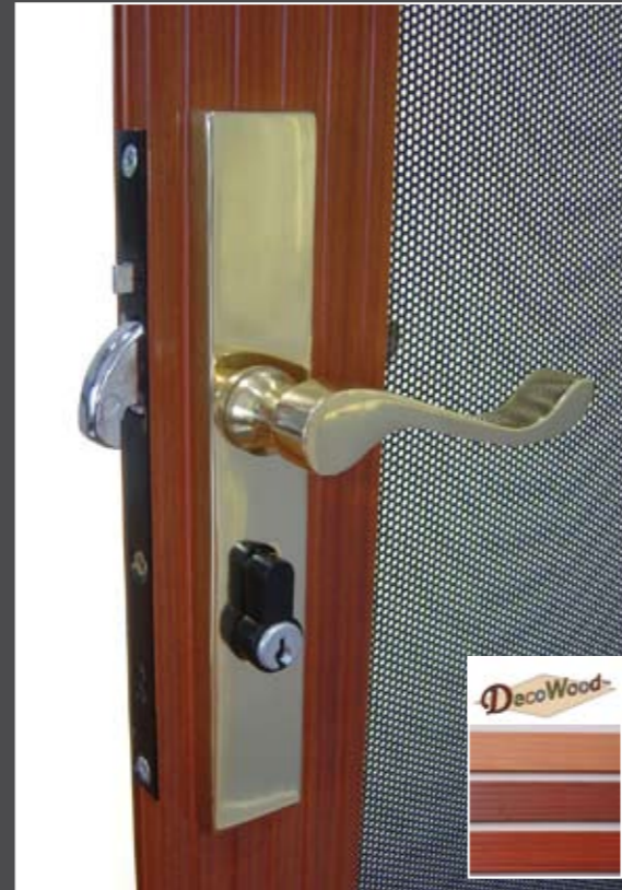
Exclusive DecoWood frame and brass hardware

Clearshield - for absolute peace of mind.