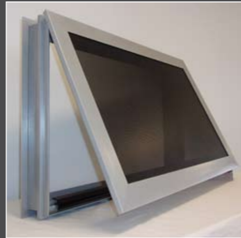
Emergency Exit Screen

Fitted over the window opening or covering the window fully. Available as top or side hinged. Optional buildout frame for Commercial or cyclonic applications. Easy Exit Keyless release mechanism.