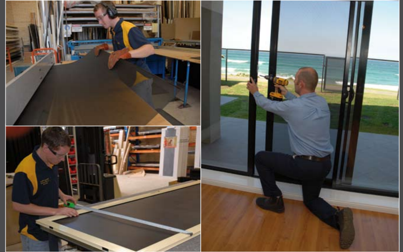
Custom measured, made and installed by qualified Clearshield staff