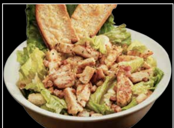
Chicken Caesar Salad