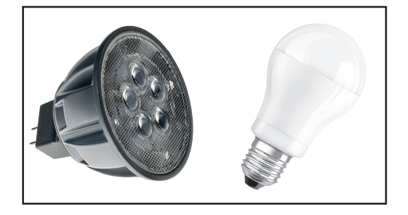
NEW LED LAMPS

If you decide to update your existing lighting, you have the option of choosing: