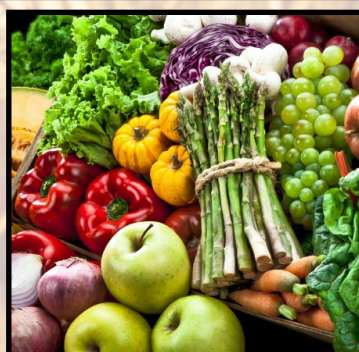
FRUIT & VEG