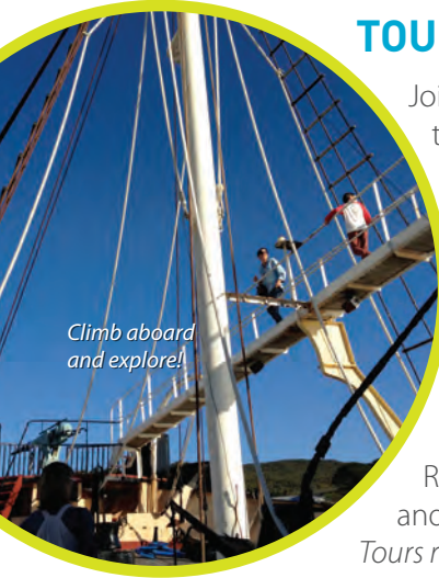
Climb aboard and explore!

Tours run daily and commence every hour from 10am to 3pm.