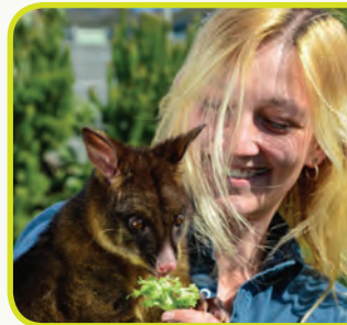
Meet our friendly native animals.

Our Australian animals are always on show with our volunteers close by to make sure you get up close and learn about the animals. Sit with our kangaroos in their grassy playground or see your first wombat.