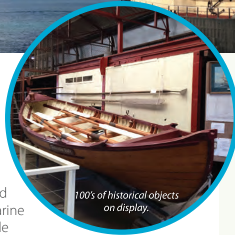
100's of historical objects on display.

Visit one of our many museums and galleries to view genuine artefacts and memorabilia. See marine art and delicate whale tooth scrimshaw.