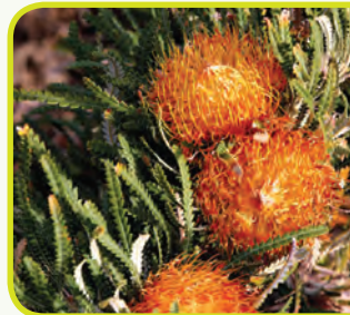
Spectacular display of wildflowers.

In spring our gardens come to life with a spectacular display of wildflowers. Follow the boardwalk trail to discover more about our beautiful flora and endangered species.