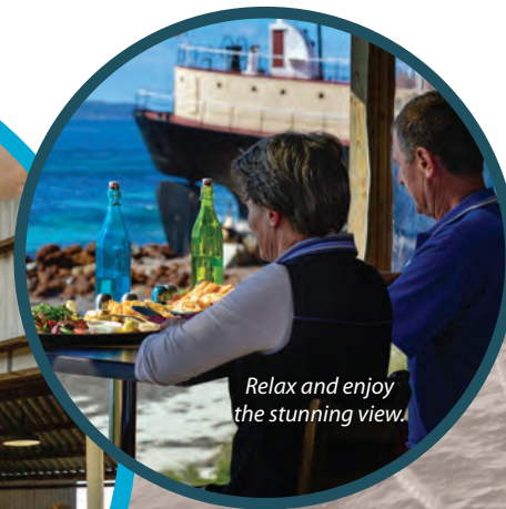
Relax and enjoy the stunning view.

Relax in our picnic areas with free BBQs and children's playground, or share a lunch in our seaside cafe. Look out over the stunning bay from one of our whale watching lookouts, and finish the day with a visit to the fascinating gift shop.