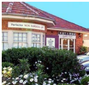
“The Retreat” at Casula