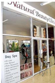
“Trends” at Liverpool

Take your Body and Soul on the Ultimate Holiday!™ Restore vitality and harmony to your life!