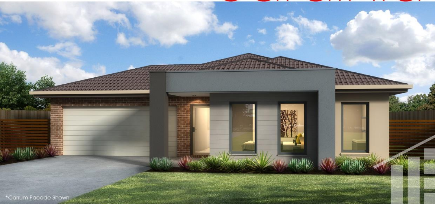
*Carrum Facade Shown