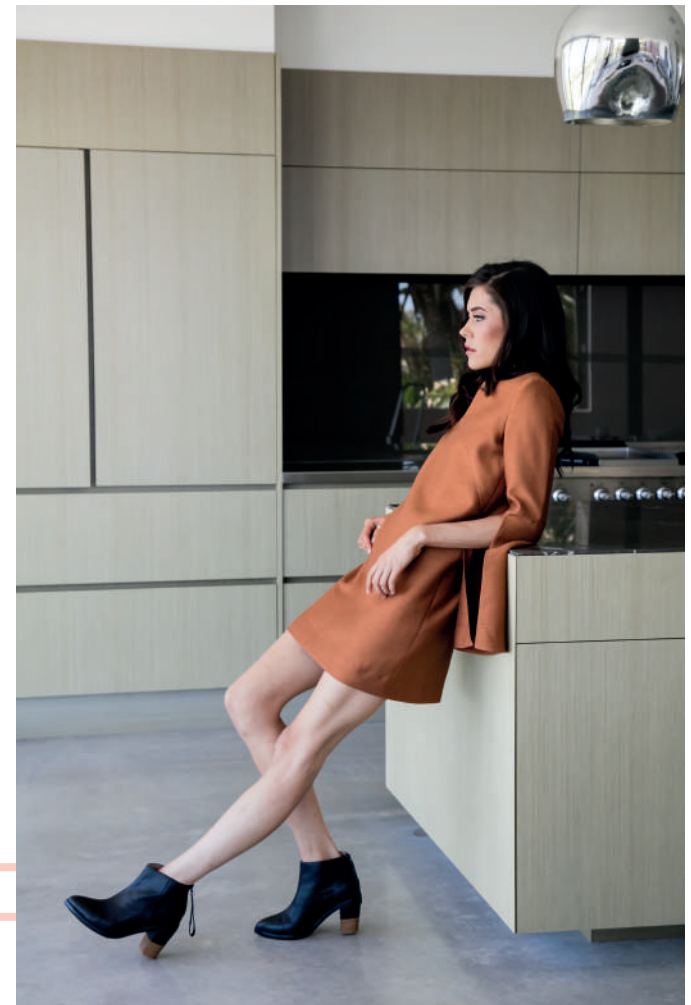
Instinct in Black or stone