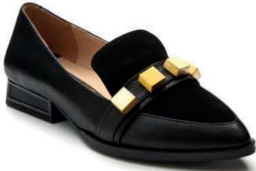
Shay by Kat Maconie in Black/Gold