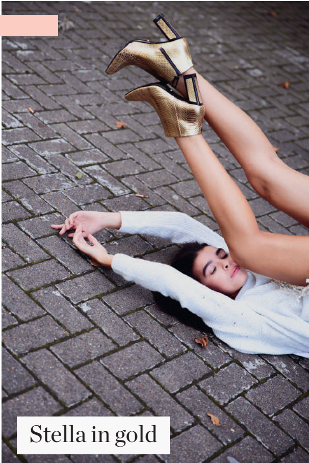
Stella in gold