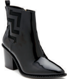
Blossom in black