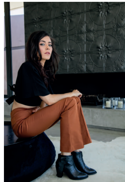
Harness in Black Croc