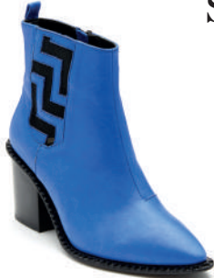
Blossom in blue