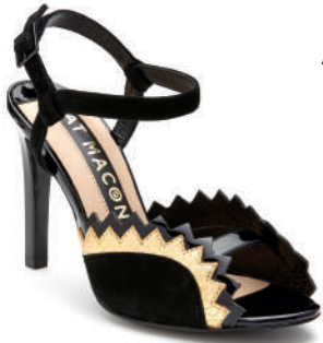
Gretchen by Kat Maconie in Black/Gold