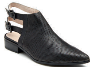
Bandit in Black