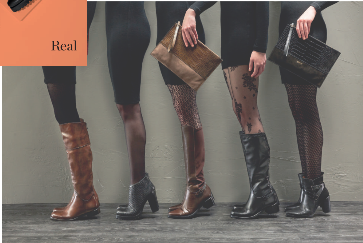
Relent by Charles Cooper Real by Charles Cooper Howy by Hispanitas Recent by Charles Cooper Hermen by Hispanitas