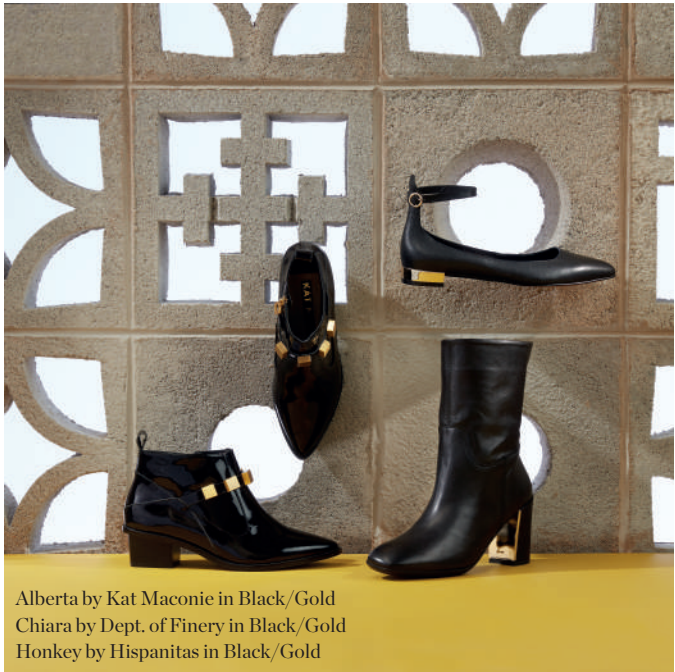
Alberta by Kat Maconie in Black/Gold

Add a finishing touch to your outfit with a pair of these striking shoes.