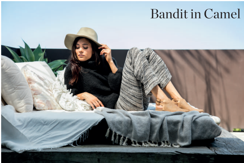
Bandit in Camel

Stylish, contemporary & well crafted footwear from Australian born designer.