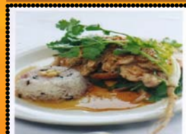
#40 Yum Gai Yang