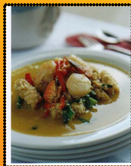
#36 Pad Pong Seafood