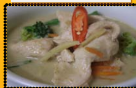
#19 Green Curry Chicken