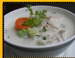
#12 Tom Kha Chicken