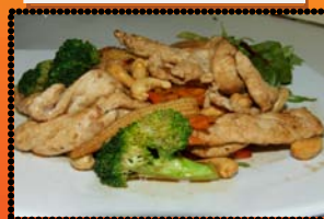
#23 Pad Cashew Nut chicken

Soft Drinks and Beer are available Please Enquire