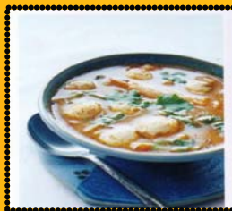
#11 Tom Yum Seafood