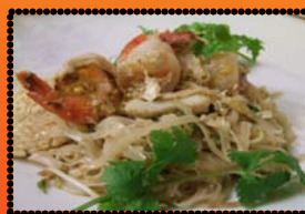
#41 Pad Thai