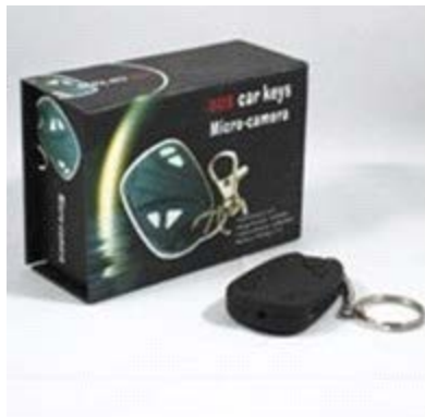
Spy Remote Control