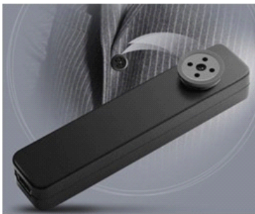
Spy Button Camera