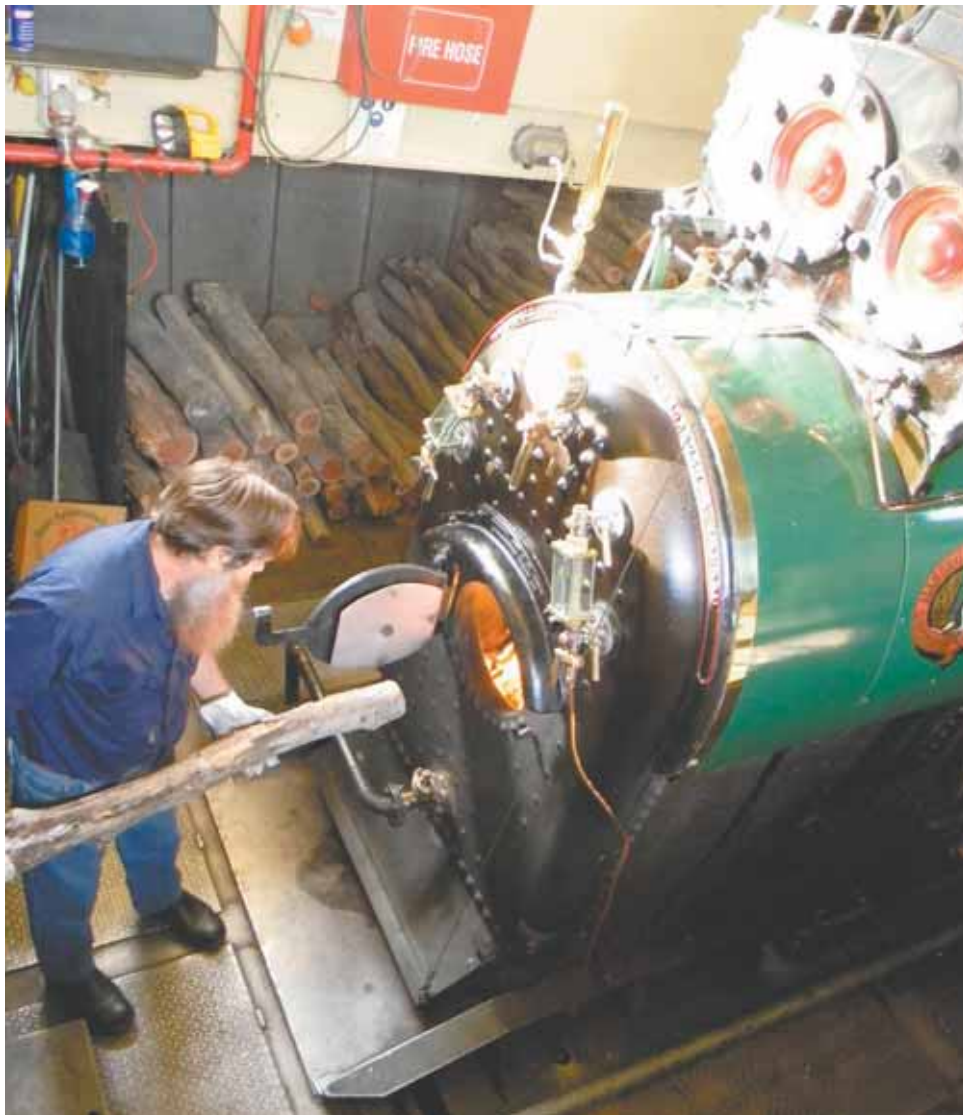
With over 45 years association with steam engines, initiated by ride on model steam trains in his family's backyards, this honorary engineer enjoyed stoking the largest engine ever – a fully restored, British Marshall, Sons and Co 1906 model

I n our want-it-now modern society, the 30th jubilee is the diamond jubilee. Traditionally, the 30th anniversary was known as the pearl anniversary. For sheer brilliance the year 2013 certainly is a pearler for GN Olsson Mastercraftsmen.