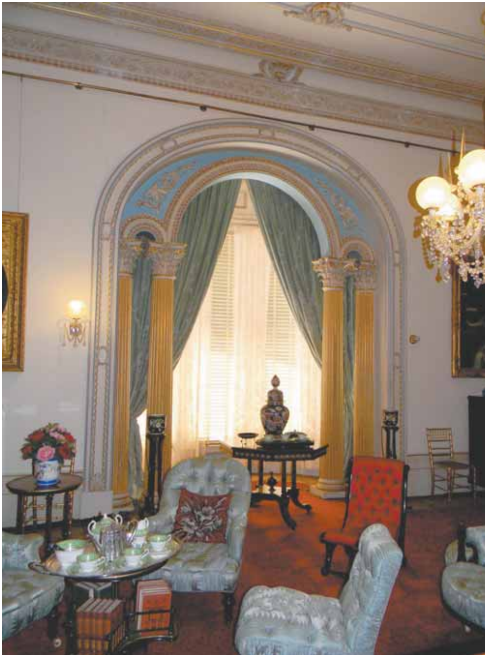
Werribee Mansion Drawing Room