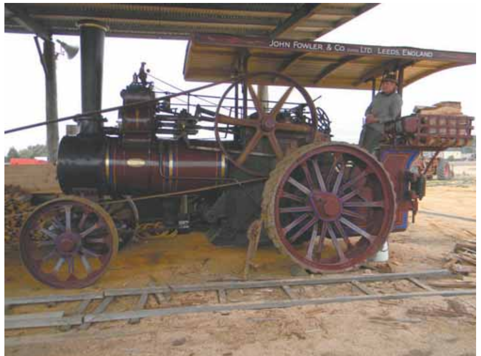
Steam driven timber mill demonstrations occurred over the weekend at Lake Goldsmith steam rally