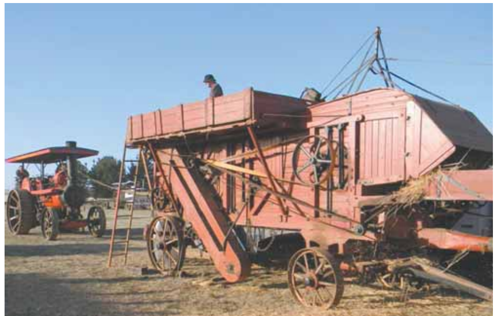
Portable steam engine driven threshing machines were regularly seen working on farms and travelling along rural roads in by the late 1800s. Grain is separated from the stalks and husks with some machines able to separate out various sized grains. Grain was bagged whilst hay was cut into fine chaff or stacked, and with later technology, baled

This year of landmark business achievement included a tribute to Australia's colonial past. The renowned and traditional restoration, conservation and reproduction commissions for local and national clientele are still a feature of GN Olsson Mastercraftsmen's services. Remarkably, this is all done in the contemporary context of our information technology world.