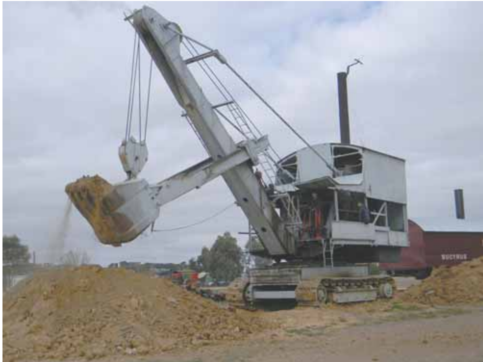
The recently restored Ruston Hornsby of Lincoln, England, Bucyrus No. 4 Face Shovel tops the scales. Originally imported in 1923 to work the Fyansford (Geelong) quarry, it remained in operation there until 1958