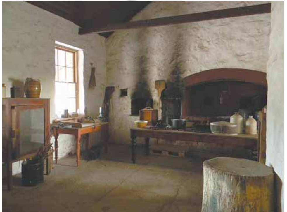
Single men's quarters kitchen at Werribee Farm

proved highly rewarding. This would be one of the best conserved and restored built and natural, Victorian era environments in Australia. There are highly formal gardens in the grounds of the mansion and the adjacent, internationally acclaimed, Tudor style Victoria State Rose Garden. Informal gardens of both