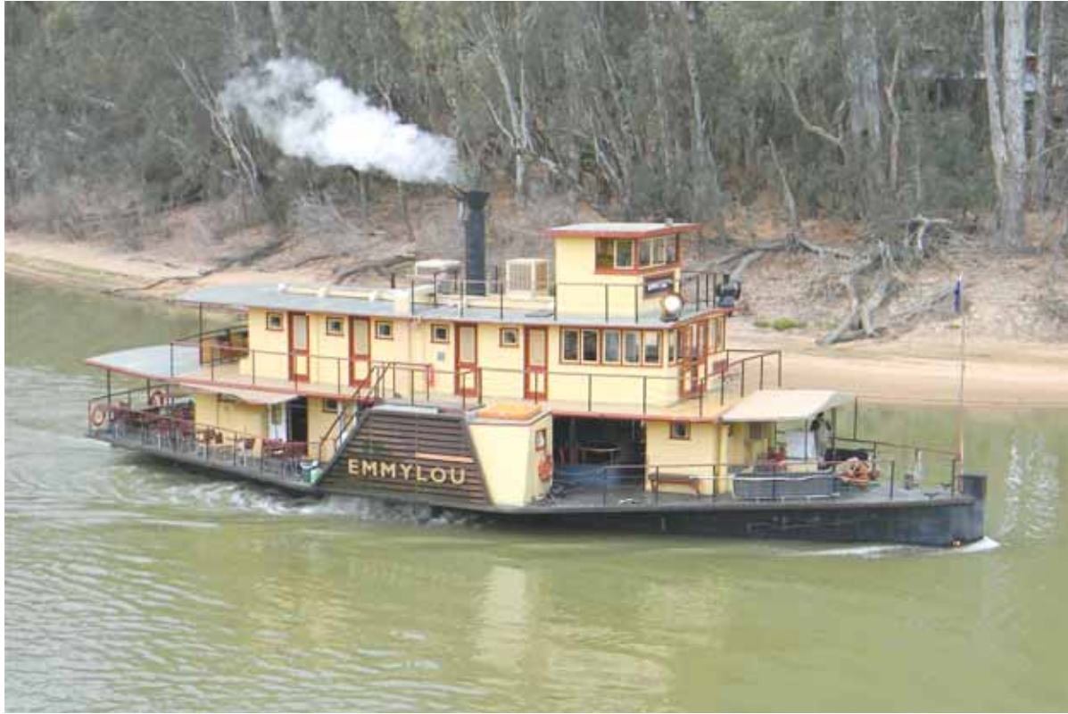
PS Emmylou on the River Murray near Echuca, Victoria