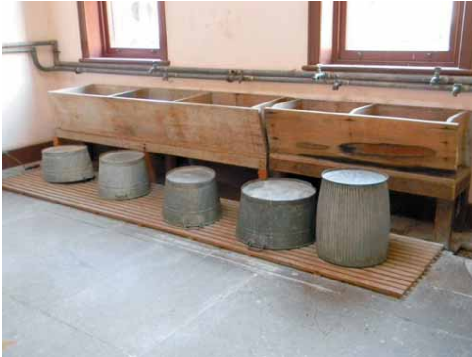
Werribee Mansion laundry was one of the largest in the colony during its heyday and included living quarters for the head laundress. It now boasts an audio visual presentation detailing the Victorian era use of laundry items and consumables