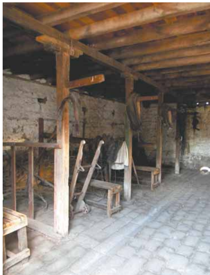
Inside the stables at Werribee Farm