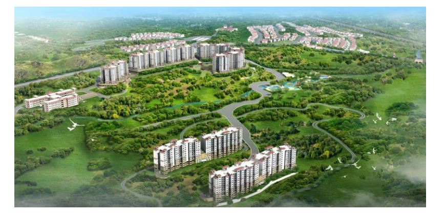
Starting from AUD 329