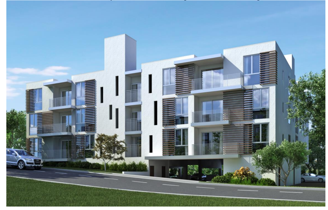
Hi Rise Exterior Renderings :