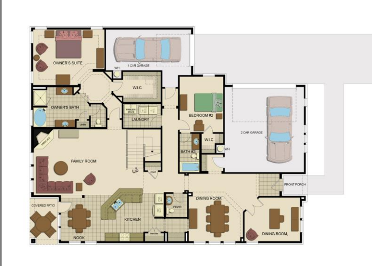
2D B&W Floor Plan $100 per plan