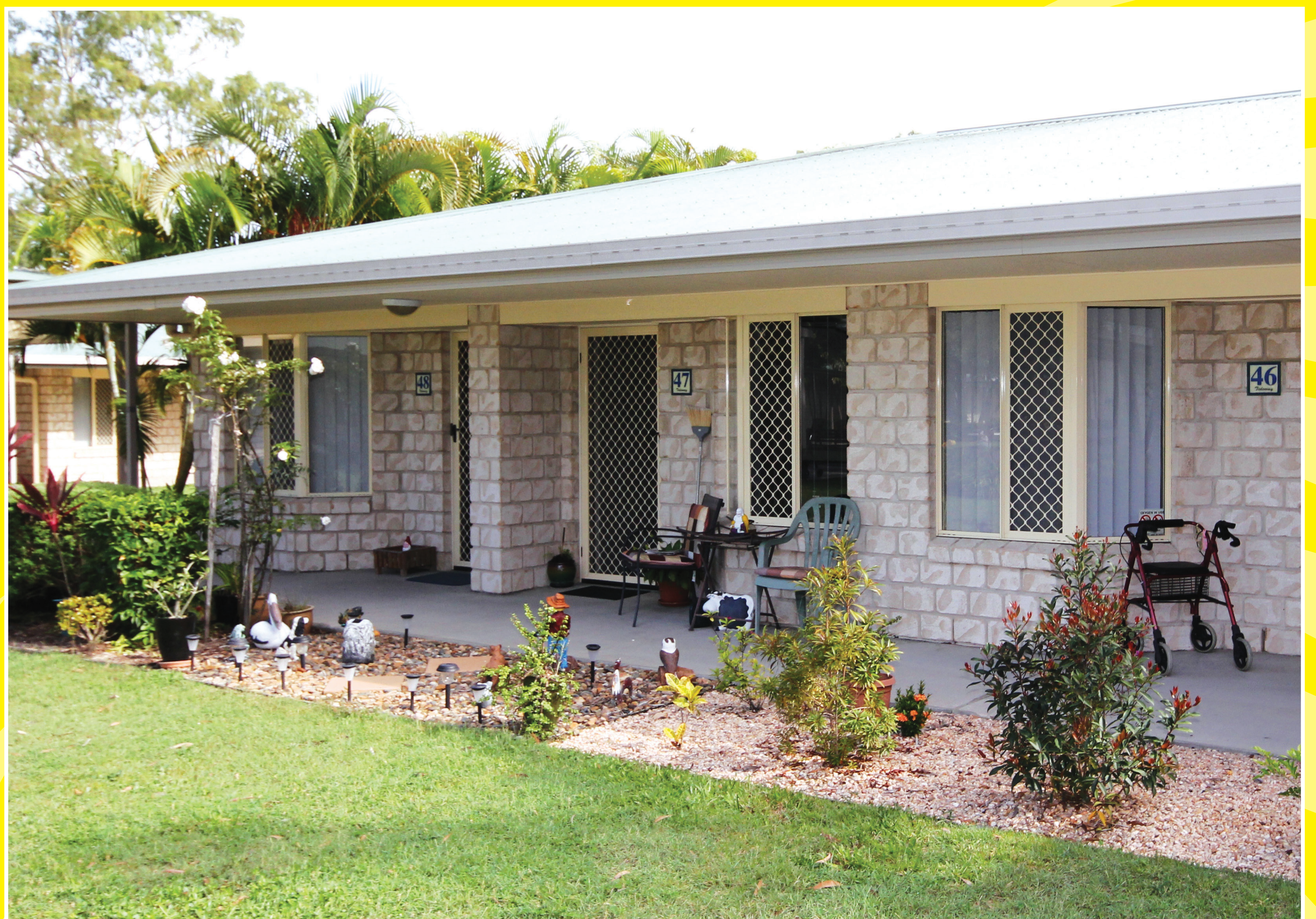
Photographs and floor plans for illustration purposes only