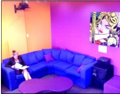
Our plush Prom Meeting Room

The average 6-person student committee working without professional help will spend literally dozens of hours each during the year just trying to see venues and compare prices, all with no guarantee of a booking or a successful night.