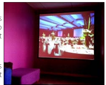
Virtual Tours on a 3 Metre Screen

Prom Night Events already has prime dates on hold with all 30 most desired venues in Sydney before the season commences every year. By booking with us, you have a 95% chance of getting the perfect venue and night.