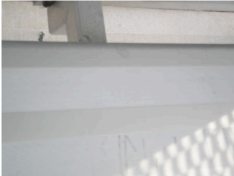
Graffiti on aluminium bus seat - After