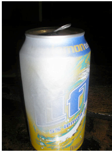
Aluminium can partially blasted to show no damage to can

Enviro Blast Australia Pty Ltd ABN 30 145 588 576