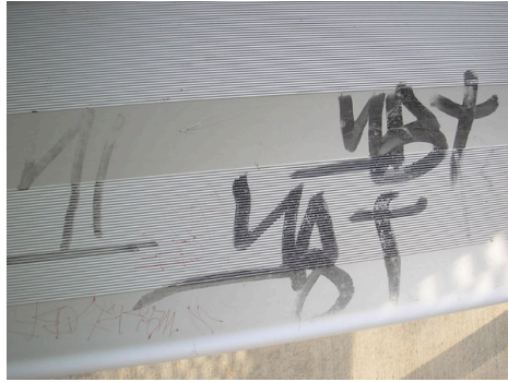
Graffiti on aluminium bus seat - Before