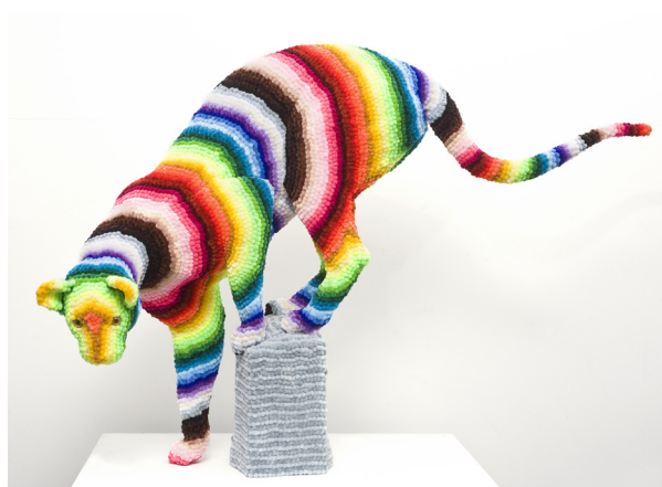
Time Traveler (large), Troy Emery, 2012