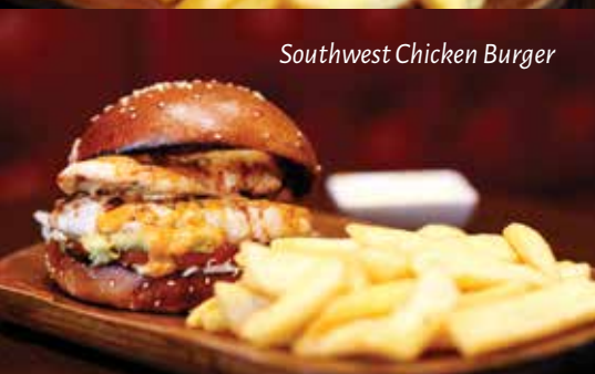
Southwest Chicken Burger