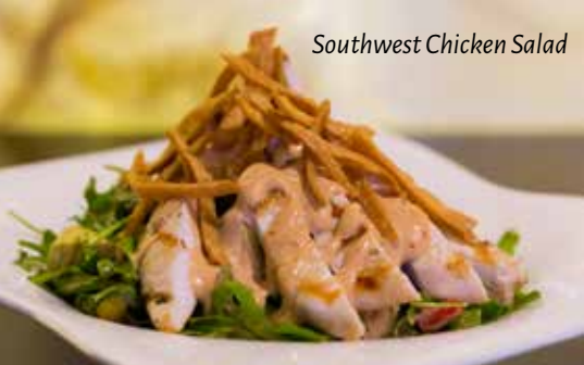
Southwest Chicken Salad