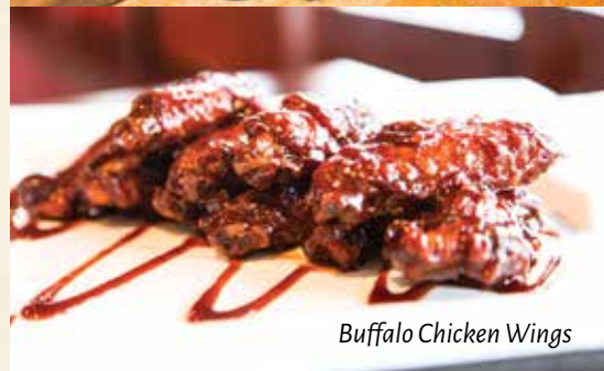
Buffalo Chicken Wings