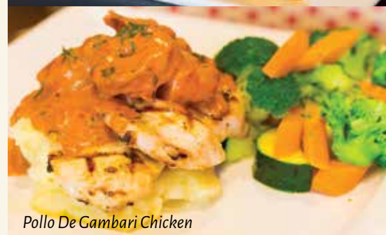
Pollo De Gambari Chicken