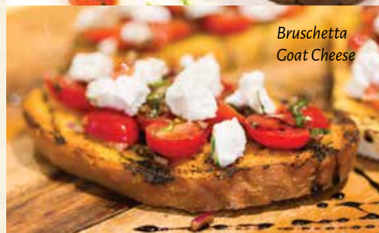
Bruschetta Goat Cheese