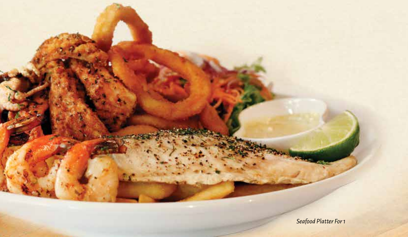
Seafood Platter For 1