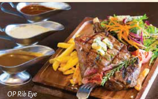
OP Rib Eye