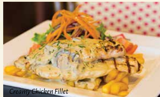
Creamy Chicken Fillet

All come with your choice of chips & salad or mash & veges