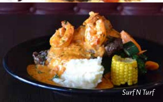
Surf N Turf