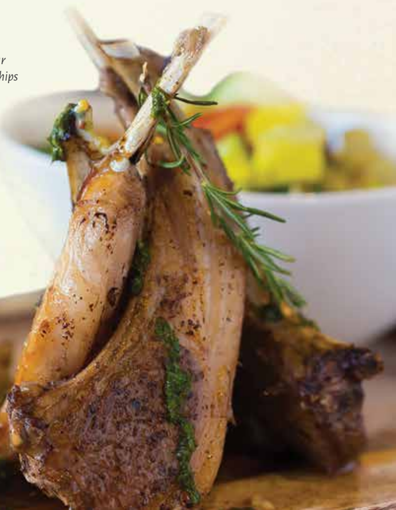
Sumac Lamb Cutlets