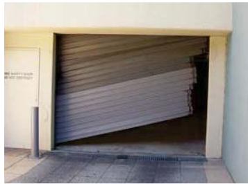
Caught Up Curtain