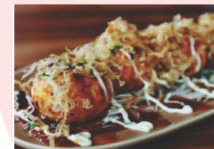
Takoyaki Deep Fried Octopus Ball 7 (6 pcs)