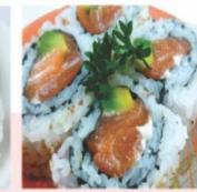
Fresh Raw Salmon & Avo Roll 6.5