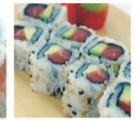
Fresh Tuna & Avo Roll 6.5