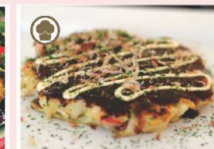
Okonomiyaki Japanese Style Pancake with House Made Sauce & Daish Bushi 6.9 (1 pcs)