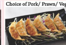
Deep Fried Gyoza Steamed Deep Fried Dumplings with Vinaigrette Dipping 6.9 (5 pcs)