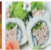
Cook Tuna Salad & Avo Roll 6