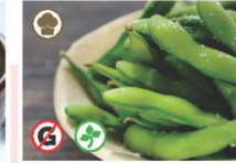
Vege Edamame Boiled Soybeans & Lightly Salted 4.5