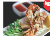
Soft Shell Crab Deep Fried Soft Shell Crab Tossed with Salt & Pepper 6.5