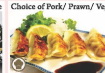
Steamed Gyoza Steamed Pan Fried Dumplings with Vinaigrette Dipping 7.9 (5 pcs)