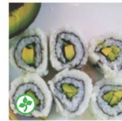
Avocado Roll 5