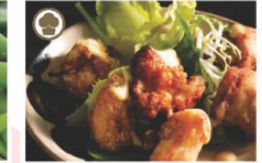
Chicken Karaage Crispy Chicken thigh Fillet Marinated in Ginger Soy Sauce 7.9 (8 pcs)