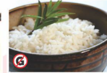
Japanese Steamed Rice 2.5