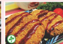
Gorokke Vegetable Croquette 6.5 (2 pcs)