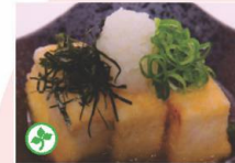
Agedashi Tofu Deep Fried Organic Silken Tofu Cubes in Shiitake Broth 7.9 (6 pcs)