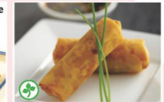
Harumaki Vegetable Spring Roll 5.9 (6 pcs)