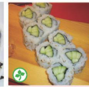
Cucumber Roll 5