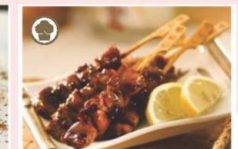
Yakitori Chicken Skewers & Greens with Teriyaki Sauce 7.5 (2 skewers)