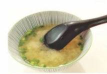
Miso Soup Soybean Paste Based Soup 2.5