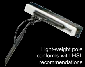
Light-weight pole conforms with HSL recommendations

The Health and Safety in the work place is of paramount importance.