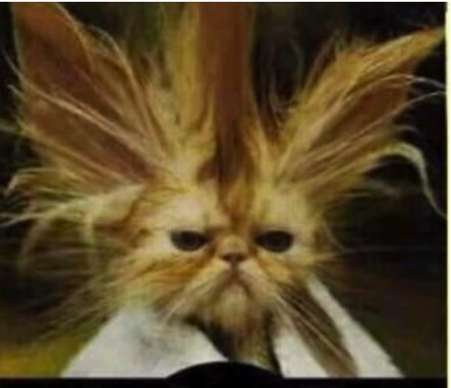
Stressed out my ASS! I am going to KILL the next Son of a Bitch who says I look STRESSED!

Tip – Most green vegetables are high alkaline. Some really high acid foods are: Fast food, milk, eggs, cream, cheese, pork and red meat.