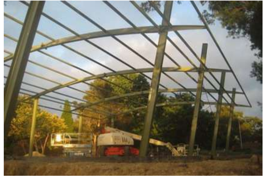
'Cola' at West Pymble Public School Designers and Project Managers