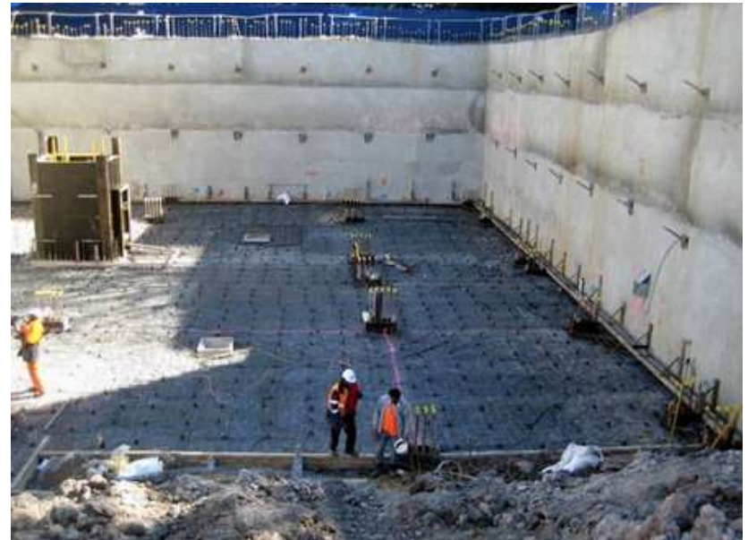
Medium Rise Apartments, Stanley Street, St. Ives