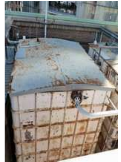
Sofitel Wentworth, Sydney Replacement roof membrane, handrails brickwork & water tanks