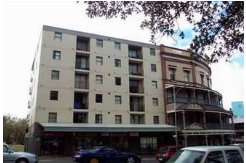
University Hall, Glebe Defective brickwork elevations