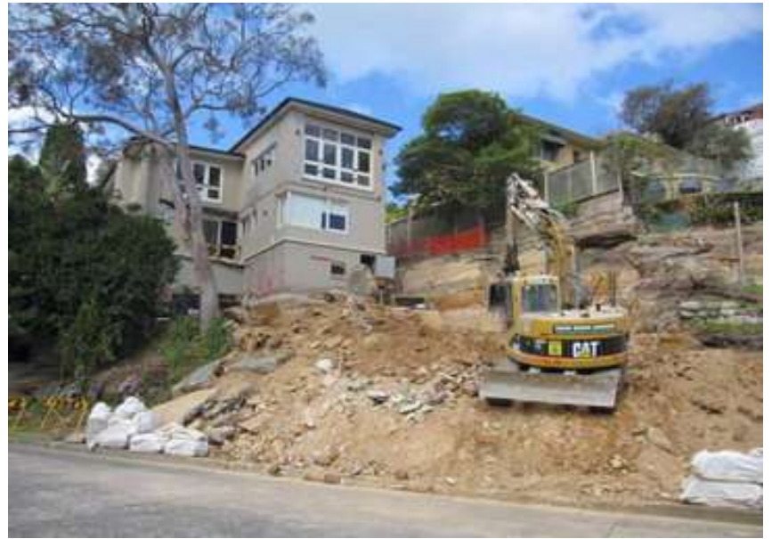
Rickard Avenue, Mosman