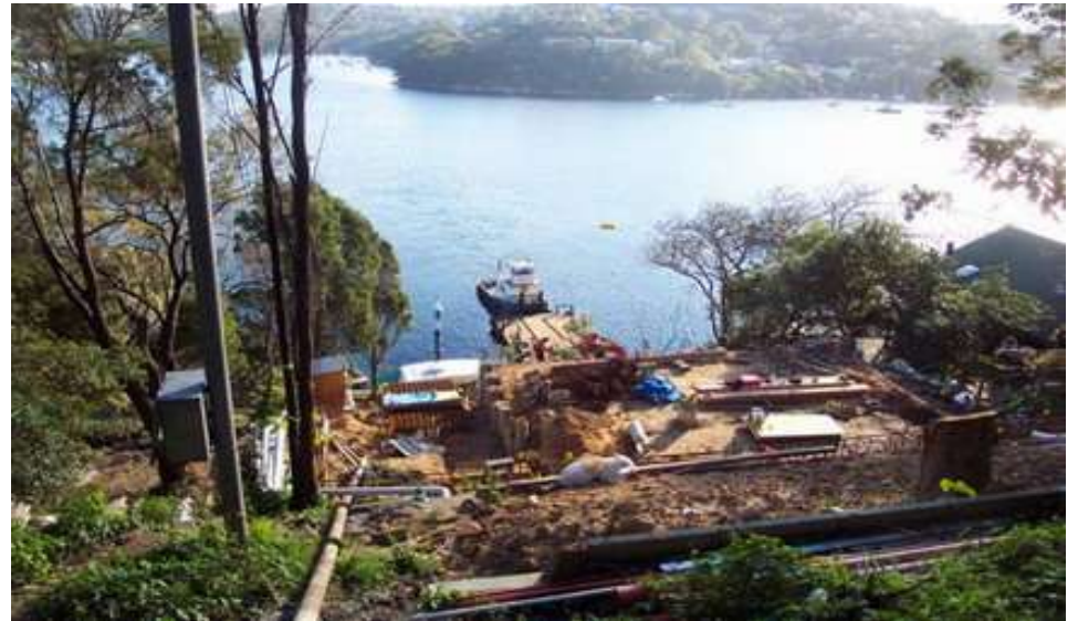
Seaforth Crescent, Seaforth