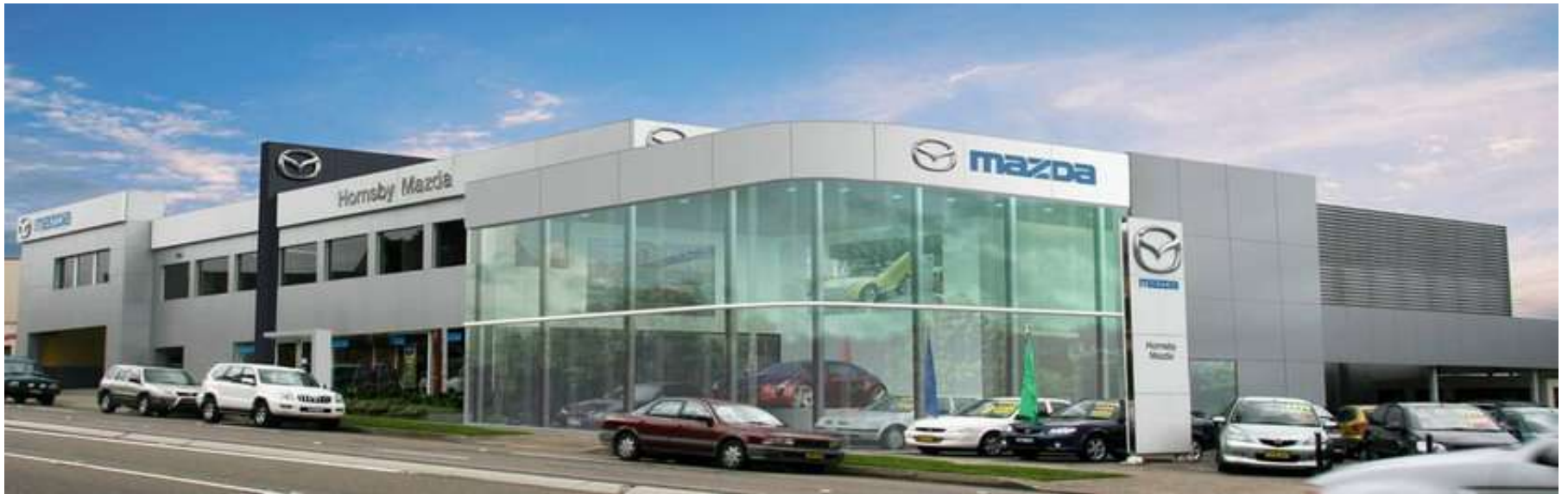
Car Show Rooms, Hornsby Automotive Group