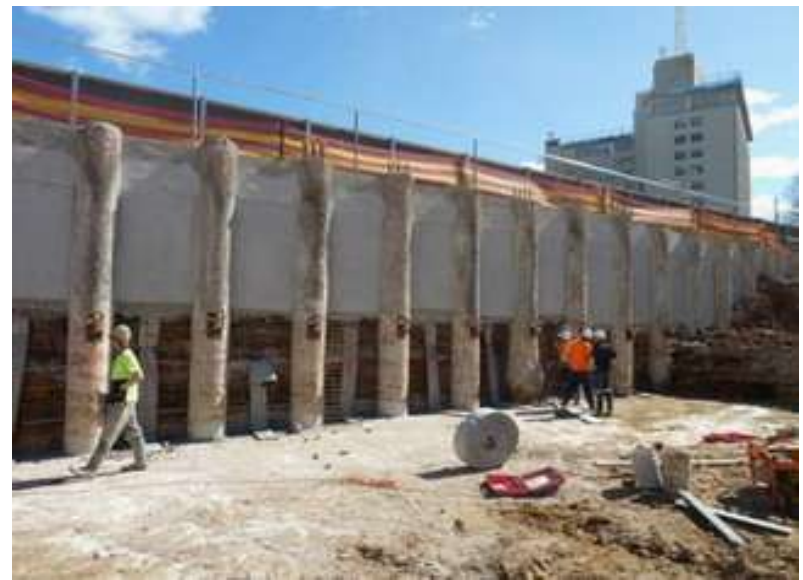
Frasers Broadway, Soldier Piles and shotcrete walls