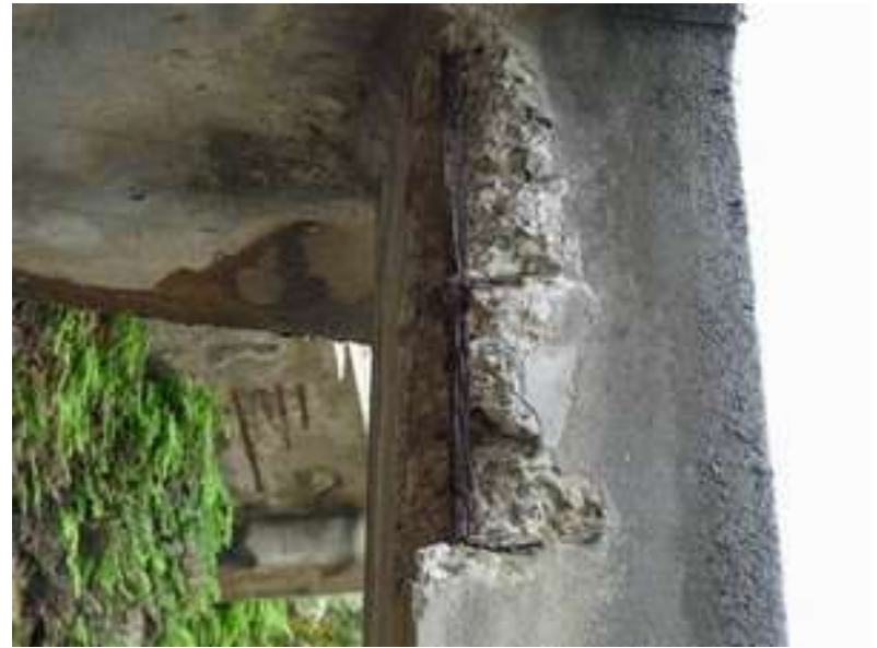
Heritage Structures, Cockatoo Island Spalling Concrete