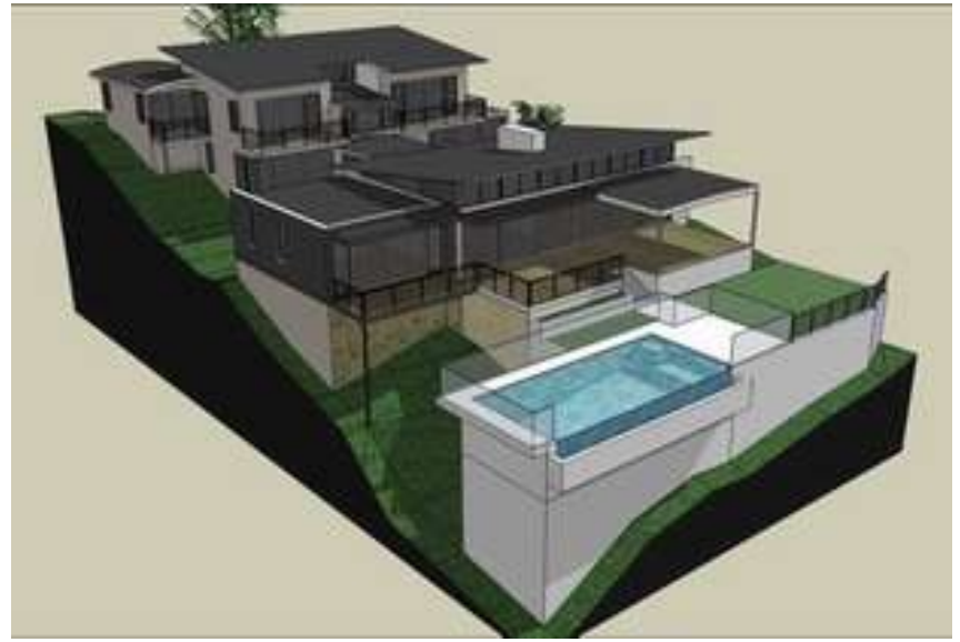
Pacific Road, Palm Beach