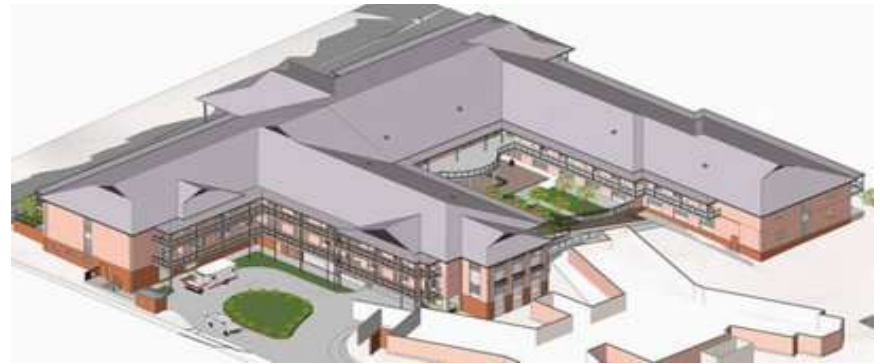
St Michael's Health Care, Casino