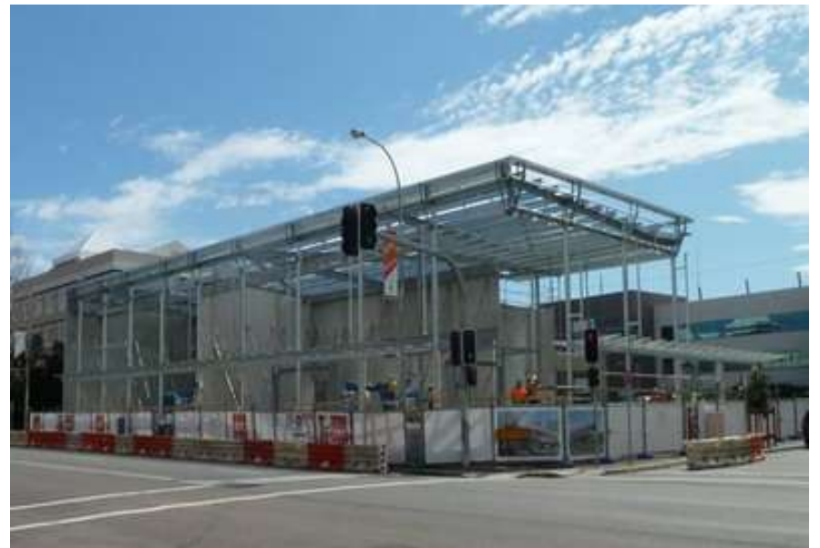
KFC Palais, Newcastle