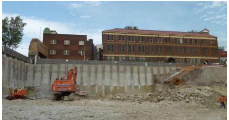
Frasers Broadway, Central Park Sydney