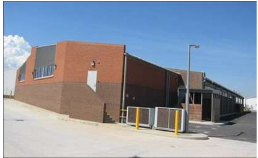
Australia Post Delivery Centre, Bathurst