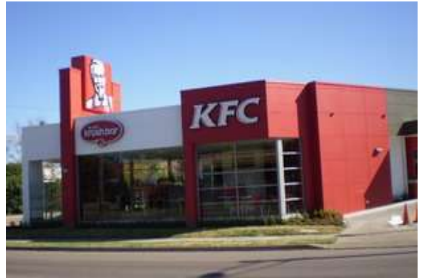
KFC STORES Belmont, Glendale, Muswellbrook & Singleton