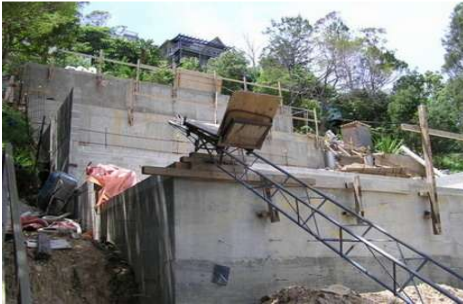
Seaforth Crescent, Seaforth