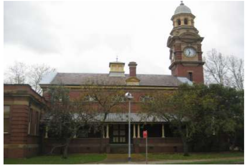
NSW Regional Court Houses Newcastle, Cowra, Condobolin & Maitland