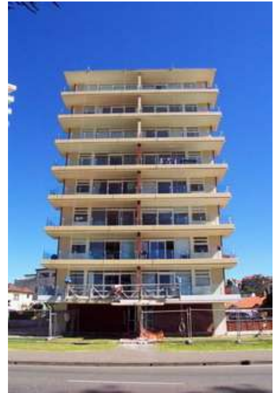
Surfways, Manly Spalling concrete and facade upgrade