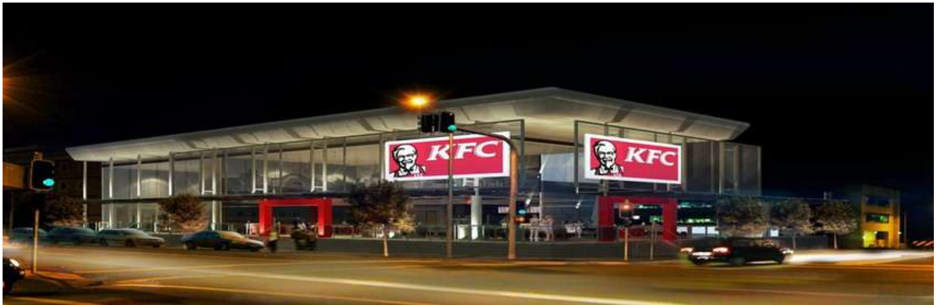
KFC Stores, Newcastle Region