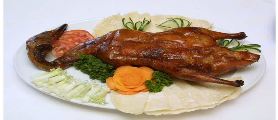
Sizzling Eye Fillet in Black Pepper Sauce 鐵板黑椒牛柳 $32.80 We use good quality eye fillet which is juicy and tender and flavoursome.