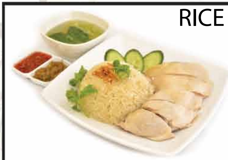
20. Hainan Chicken Rice