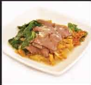
17. Kway Teow Siram fr $8.50