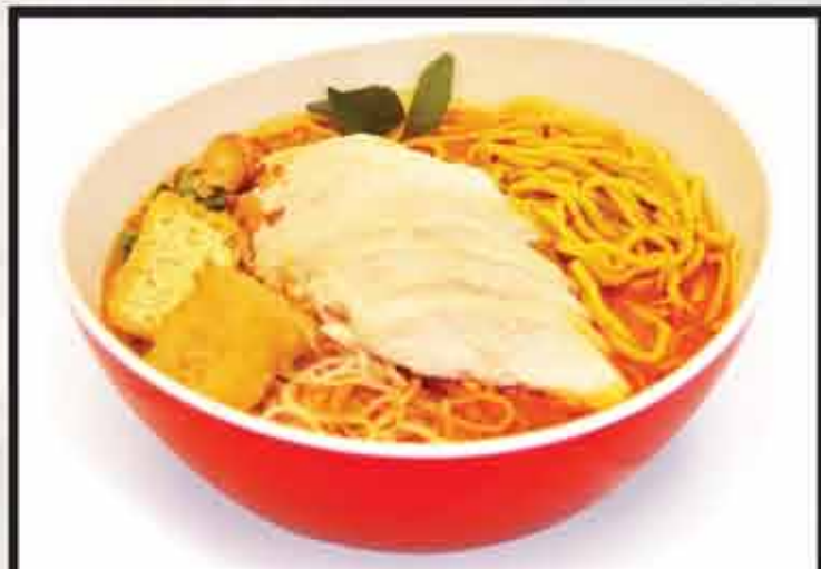
9. Chicken Laksa