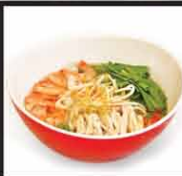
12. Ipoh Hor Fun $9.50