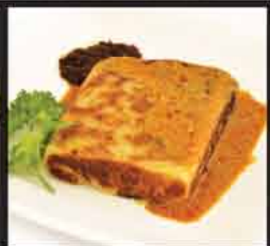
6. Murtabak $8.50