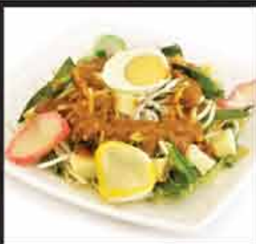
5. Gado Gado $8.50