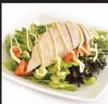
7. Chicken Salad $9.50