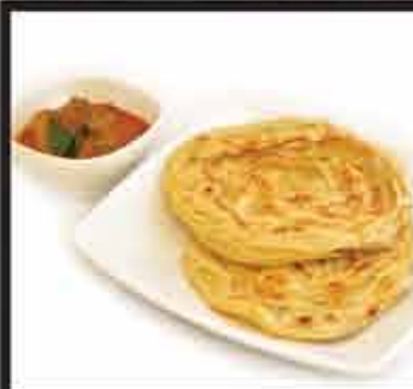
8. Roti Canai $8.50 2 pcs with curry chicken