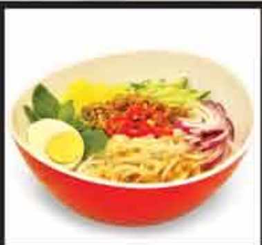
10. Asam Laksa $10.50