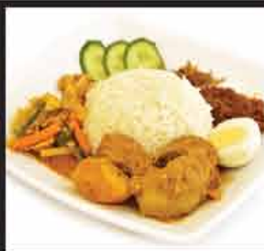
21. Nasi Lemak Chicken $10.50