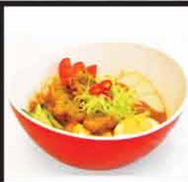
13. Mee Rebus $9.50

Hokkien noodle served with spicy sweet potato & pumpkin based gravy, this dish consist of fish cake, prawn cake, boiled egg, steamed potato, bean sprouts garnished with fresh chilli & calamansi lime.