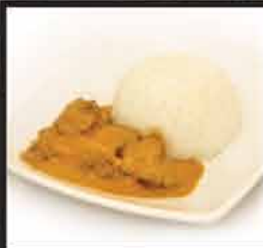
22. Kurma Curry Rice $9.50

A Malaysian styled fried-rice consist of mixed vegetables, egg & shrimps.