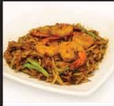
16. Ipoh Char Kway Teow fr $10.50

15. Mee Goreng..... $9.50 Malaysian styled fried Hokkien noodles consist of fish cake, prawn cake, potato, vegetable, bean curd & shrimps