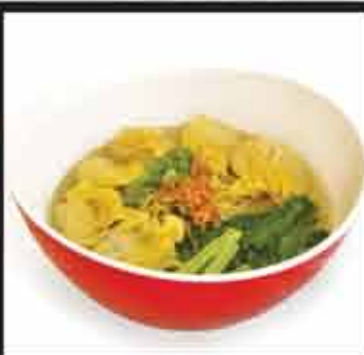
11. Wonton Noodle Soup $9.50