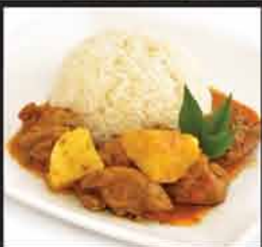
18. Curry Chicken Rice $9.50