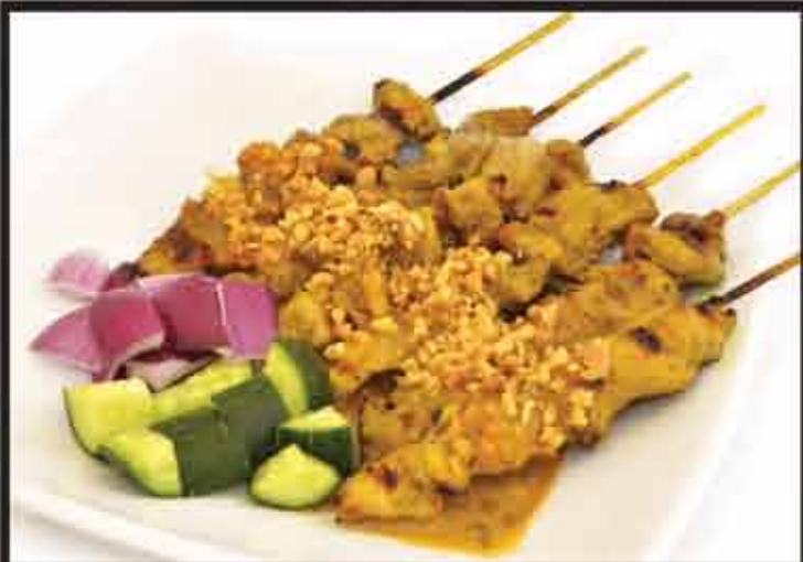
1. Chicken Satay $9.00 6 sticks of Chicken Satay