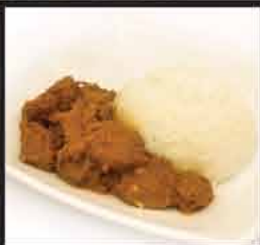
19. beef Rendang Rice $9.50