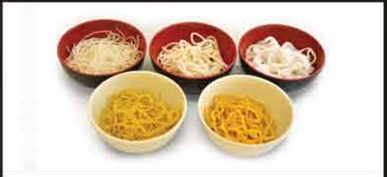
Noodle Types Mihun|Sang Mee|Lai Fun|Hokkien Noodle|Hor Fun