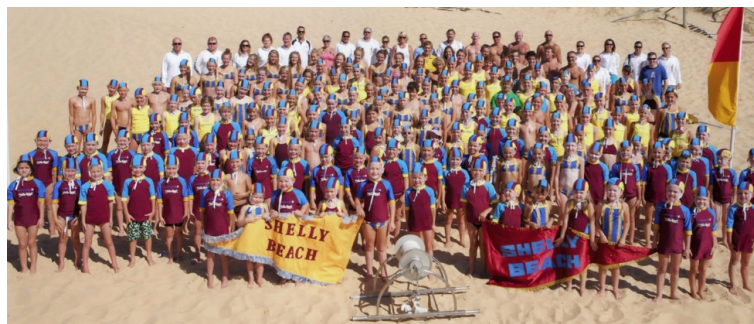
“Shelly Beach Where Friends Meet...”

Please allow 5 business days for processing and up to 10 business days for receipt to be received