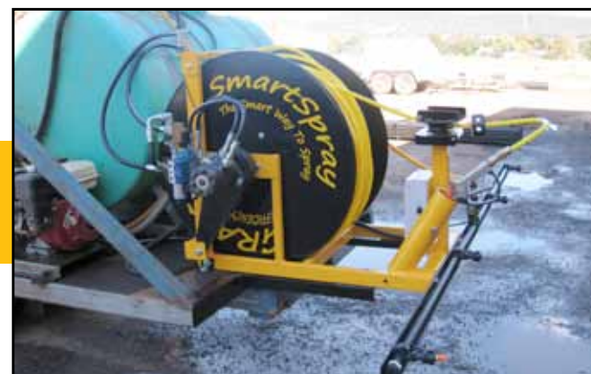
300m Hydraulic Drive SmartSpray Reel with 12m boomless jet boom to suit existing sprayer.