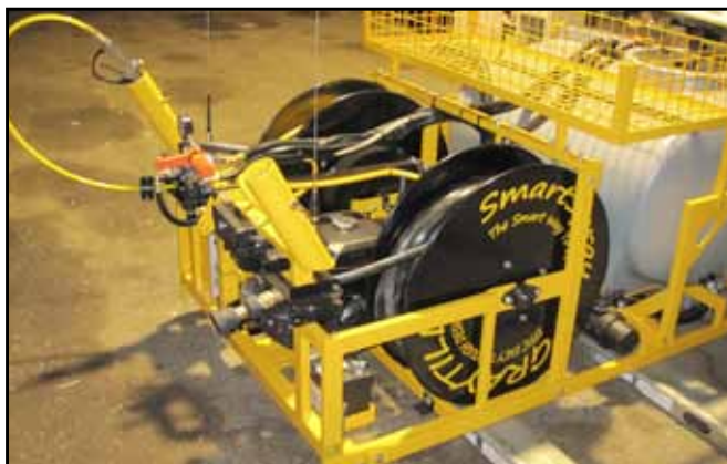
Twin Reel SmartSpray with fire hose.