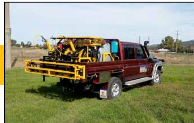
Twin Reel SmartSpray to suit dual cab tray with diesel engine, 10m SmartSpray Boom and triple nozzle boomless jet.