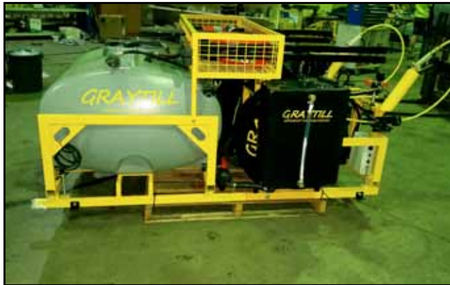
SmartSpray with custom 55L flush tank.