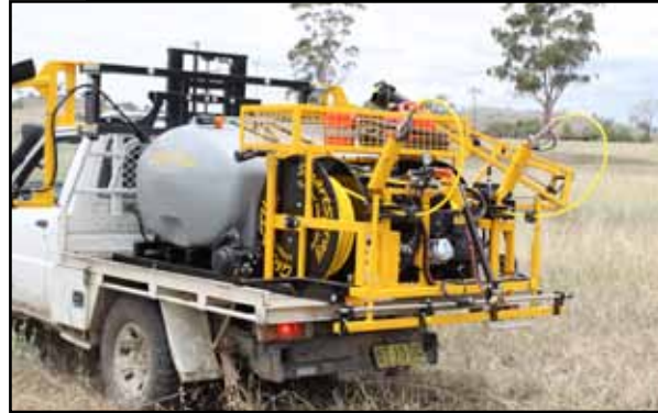
SmartBoom with integrated SmartSpray with boomless jet.