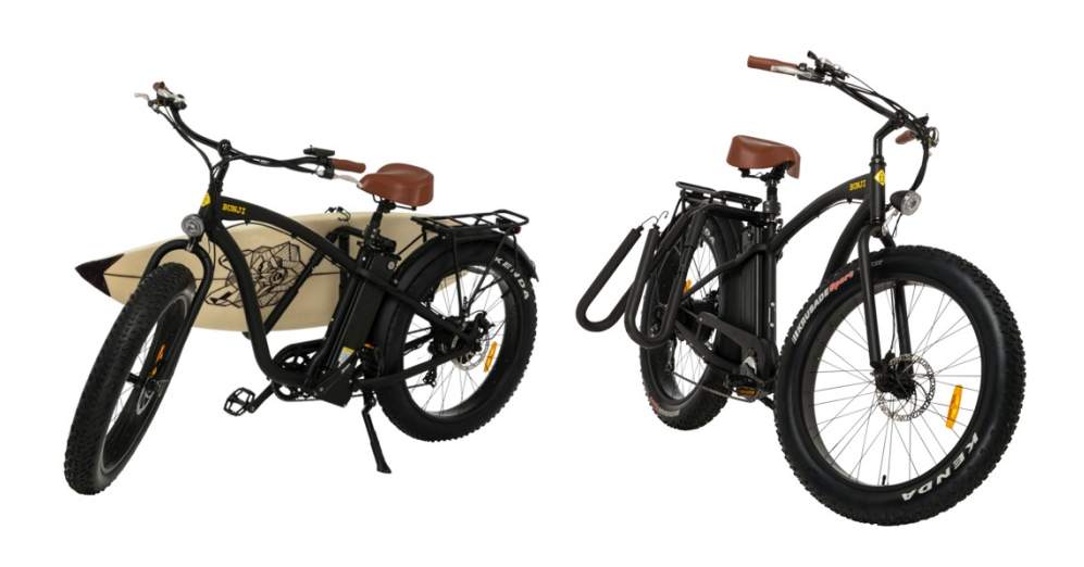
"Bunji" Fat tire beach cruiser

250W Bafang motor giving you all the power you need to fly up those hills. 25kph limited making them legal to ride anywhere any time. Onboard computer with 5 levels of assist, integrated LED headlights as well as speed and distance tracking.