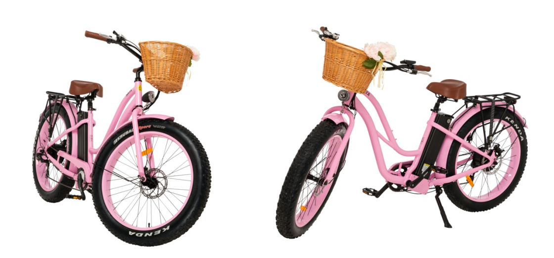
"Kaya" Ladies step-through beach cruiser $2599.99

250W Bafang motor giving you all the power you need to fly up those hills. 25kph limited making them legal to ride anywhere any time. Onboard computer with 5 levels of assist, integrated LED headlights as well as speed and distance tracking.