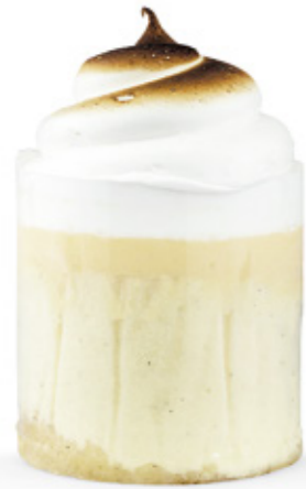
Lemon curd meringue cheesecake / GF / 9.5

Smooth and creamy cheesecake topped off with refreshing lemon curd and meringue frosting