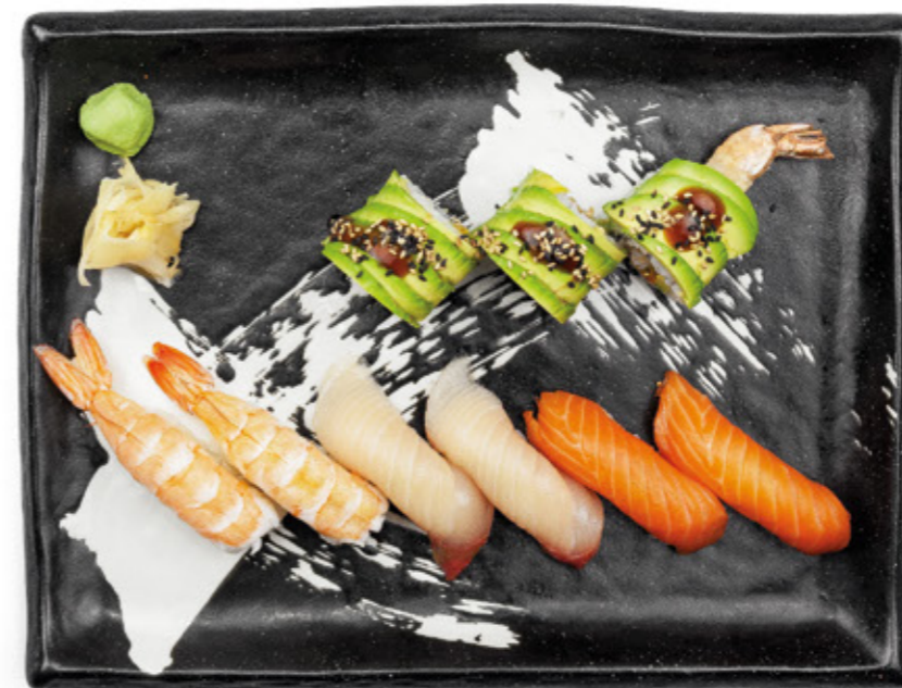
Nigiri set (9pcs.) / 16.5

Salmon, Prawn, Kingfish nigiri and Shrimp roll with avocado