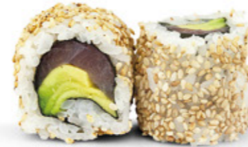
Tuna & avocado roll (6pcs.) GFO / 12.5