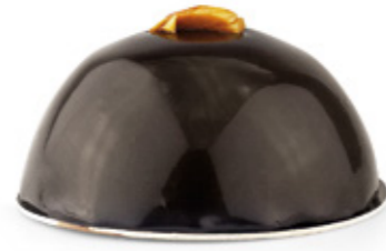
Caramel chocolate dome GF / 9.5

Smooth and creamy cheesecake topped off with refreshing lemon curd and meringue frosting