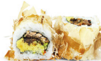
Crunchy salmon roll (6pcs.) 6.5 GFO

Crab stick, avocado and cucumber with mayonnaise rolled in flying fish roe