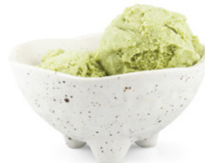
Green tea ice cream (1 scoop) / 3

Layers of cinnamon spiced sponge cake, light mascarpone marsala sabayon and organic coffee come in an instant 'pick me up' treat