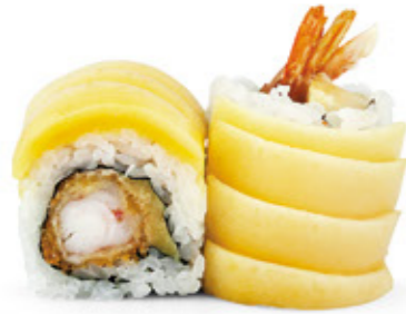
Shrimp roll with mango (6pcs.) / 10.5 Breaded shrimp with miso aioli sauce roll topped with mango