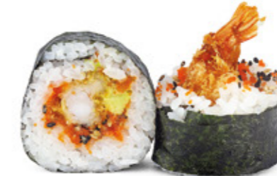
Tempura shrimp roll (5pcs.) 7.5 Breaded shrimp, avocado, capelin roe and sesame seeds with spicy and unagi sauces