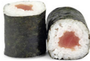
Tuna roll (6pcs.) GFO / 7.5