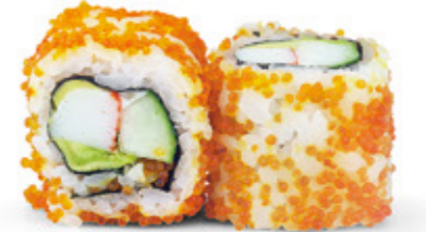
California roll (6pcs.) / 8.5

Avocado and cucumber rolled in sesame seeds