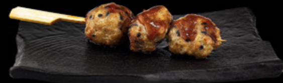
Juicy chicken meatballs with yakitori sauce / 4.5