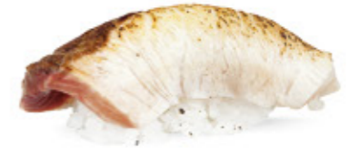
Aburi kingfish nigiri (2pcs.) 4.5