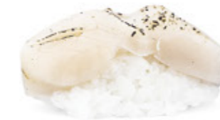
Aburi scallop nigiri (2pcs.) 7.5