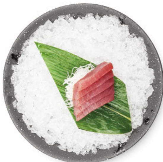
Tuna sashimi / GF / 12.5