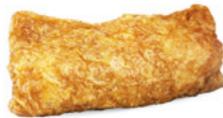
Inari nigiri (2pcs.) VG / 3.5