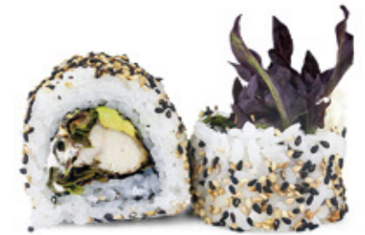
Crunchy chicken roll (5pcs.) 6.5 Grilled chicken tenderloin, lettuce, cream cheese, avocado, sesame seeds and tempura flakes with spicy and unagi sauces