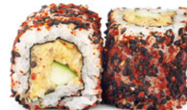
Spicy tuna roll (6pcs.) / 11.5

Salmon and avocado with cream cheese rolled in capelin roe