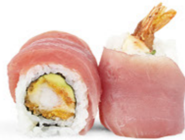
Shrimp roll with tuna (6pcs.) 17.5 Breaded shrimp and avocado with spicy sauce roll topped with tuna and flying fish roe