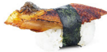
Grilled eel nigiri (2pcs.) / 5.5