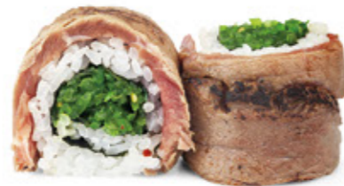
Aburi beef roll (6pcs.) 14.5 Seaweed salad roll topped with seared beef, sesame seeds and aburi sauce