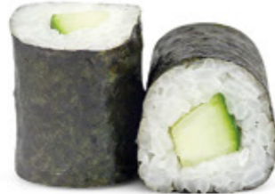
Cucumber roll (6pcs.) VG / GFO / 3.5