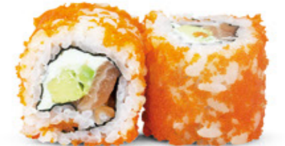
Alaska roll (6pcs.) GFO / 9.5

Breaded shrimp and avocado with spicy and unagi sauces rolled in sesame seeds