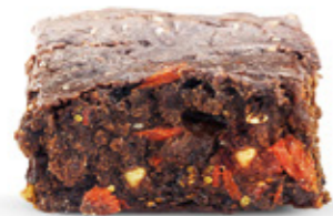
Cacao & Goji brownie GF / VG / 8.5

Dense and rich chocolaty cake with organic cacao and goji berries