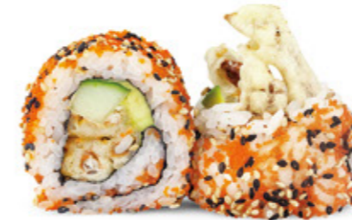
Soft shell crab roll (5pcs.) 8.5 Tempura soft shell crab, cucumber and avocado with spicy sauce topped with capelin roe, sesame seeds and unagi sauce