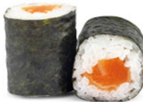
Salmon roll (6pcs.) GFO / 5.5