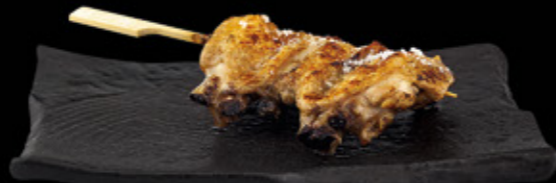
Crispy chicken wings GF / 3.5