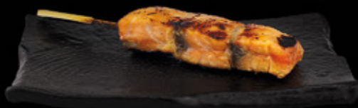
Miso marinated salmon / 5.5