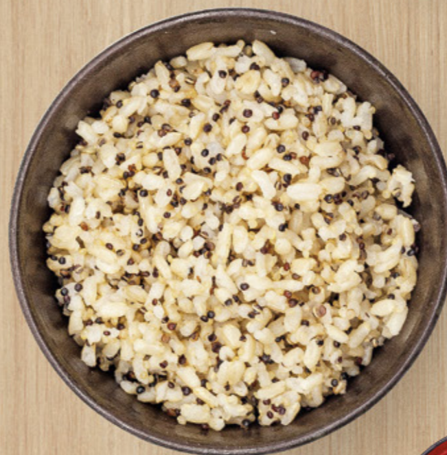
Brown rice with quinoa VG / 5