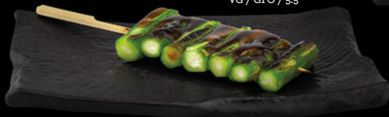
Asparagus with teriyaki sauce VG / GFO / 5.5