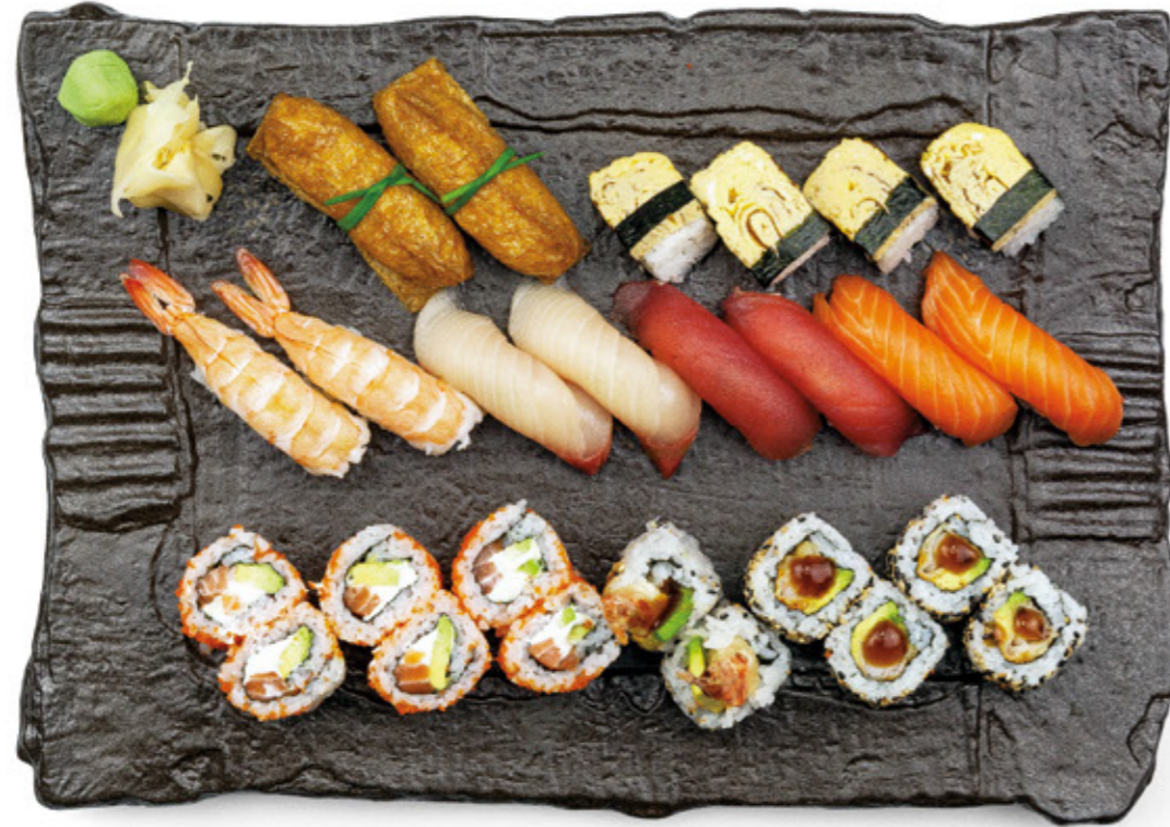
Sushi set (24pcs.) / 34.5 Salmon, Tuna, Kingfish, Prawn, Tamagoyaki nigiri, Crispy Shrimp roll and Alaska roll