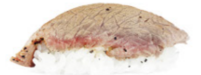
Aburi beef nigiri (2pcs.) 5.5