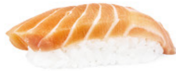
Salmon nigiri (2pcs.) GFO / 4.5