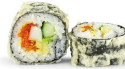
Tempura big roll (5pcs.) 8.5 Crabstick, avocado, cucumber and flying fish roe with miso aioli sauce roll fried in tempura batter with spicy sauce on top