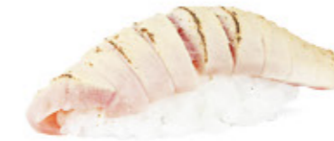
Aburi tuna nigiri (2pcs.) 6.5