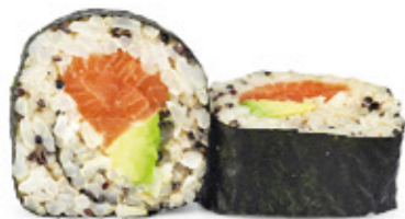
Salmon quinoa roll (5pcs.) 7.5

Brown rice roll with quinoa, salmon and avocado