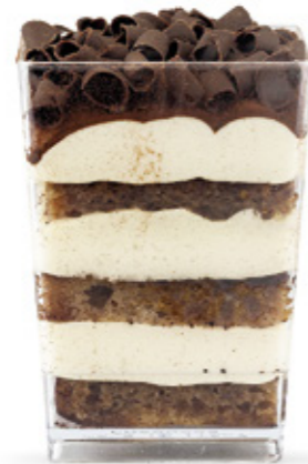
Tiramisu GF / 9.5

Dense and rich chocolaty cake with organic cacao and goji berries