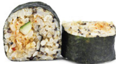
Tuna quinoa roll (5pcs.) / 9.5

Brown rice roll with quinoa, salmon and avocado