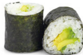
Avocado roll (6pcs.) VG / GFO / 4