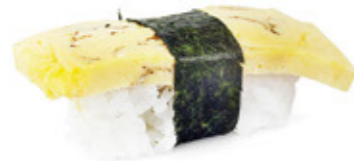
Tamagoyaki nigiri (2pcs.) / 3.5