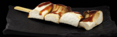
King oyster mushrooms glazed with teriyaki sauce VG / GFO / 4.5