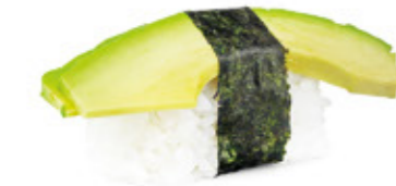
Avocado nigiri (2pcs.) VG / GFO / 3.5