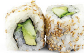
Avocado & cucumber roll (6pcs.) VG GFO / 5.5

Avocado and cucumber rolled in sesame seeds