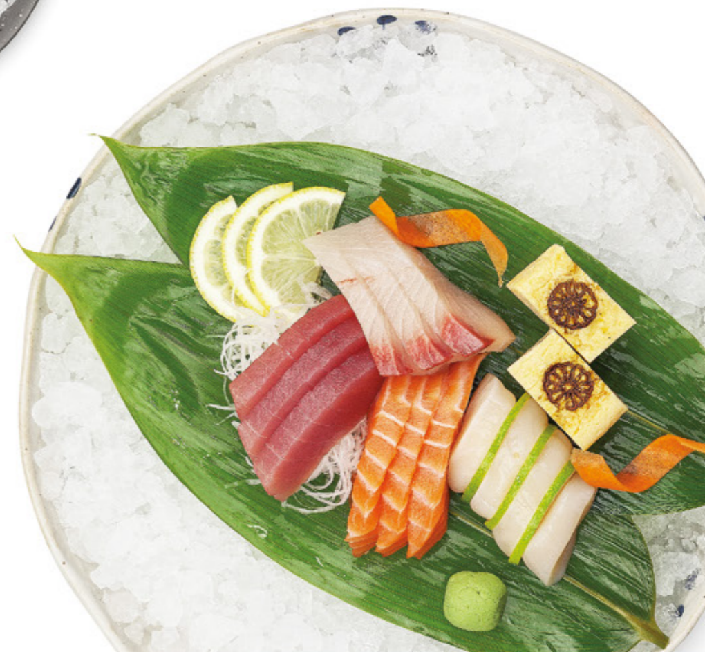
Sashimi deluxe GFO / 24.5 Assortment of salmon, tuna, kingfish, scallop and tamagoyaki sashimi