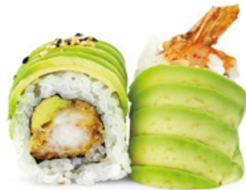
Shrimp roll with avocado (6pcs.) 11.5 Breaded shrimp with spicy sauce roll topped with avocado, unagi sauce and sesame seeds