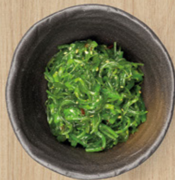
Seaweed salad VG / 4.5

Set modification (minor changes only) – $5