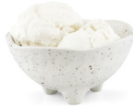
Vanilla ice cream (1 scoop) / 2.5

Delicious caramel chocolate mousse with soft caramel centre on almond cacao crunchie