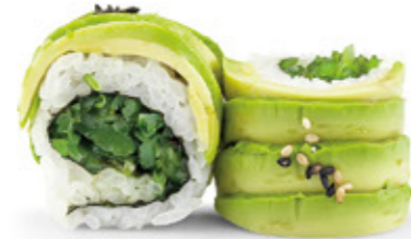
Seaweed roll with avocado (6pcs.) VG 9.5 Seaweed salad roll topped with avocado and sesame seeds