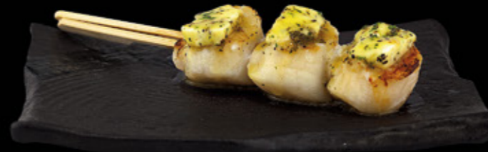
Gently grilled scallops with parsley butter GF / 9.5