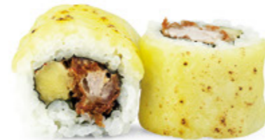
Aburi cheese roll (6pcs.) 10.5 Breaded chicken thighs and mango with spicy sauce roll topped with seared cheese