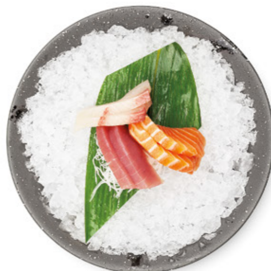
Mixed sashimi GF / 13.5 Assortment of salmon, tuna and kingfish sashimi