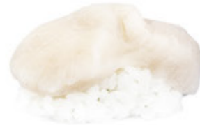
Scallop nigiri (2pcs.) GFO / 6.5