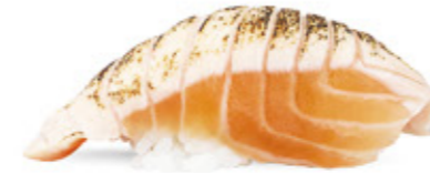
Aburi salmon nigiri (2pcs.) 4.5