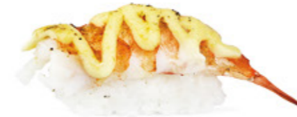
Aburi prawn nigiri (2pcs.) 5.5