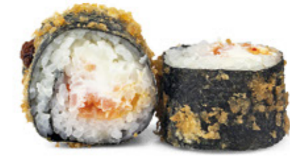
Crispy spicy salmon roll (5pcs.) 11.5 Salmon mixed with spicy sauce and cream cheese, fried in bread crumbs with miso aioli sauce on top