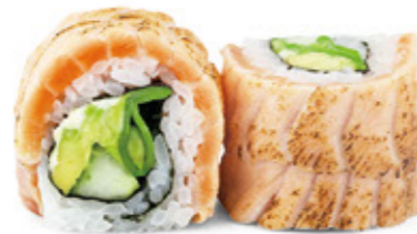
Aburi salmon roll (6pcs.) 13.5 Avocado, snow peas and cucumber with miso aioli sauce roll topped with seared salmon, unagi sauce, sesame seeds and salmon roe