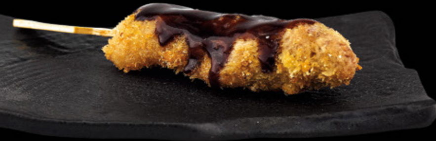
Breaded pork with tonkatsu sauce / 5.5