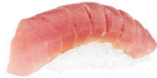
Tuna nigiri (2pcs.) GFO / 5.5