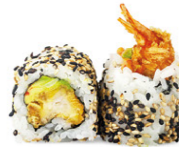
Crispy shrimp roll (6pcs.) / 9.5

Crunchy grilled salmon skin and avocado rolled in dried fish flakes