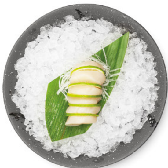
Scallop sashimi / GF / 11.5