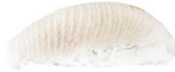
Kingfish nigiri (2pcs.) GFO / 4.5