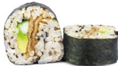
Veggie quinoa roll (5pcs.) VG / 5.5

Brown rice roll with quinoa, spicy tuna and cucumber