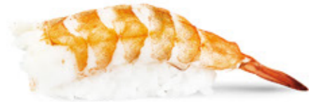
Prawn nigiri (2pcs.) GFO / 4.5