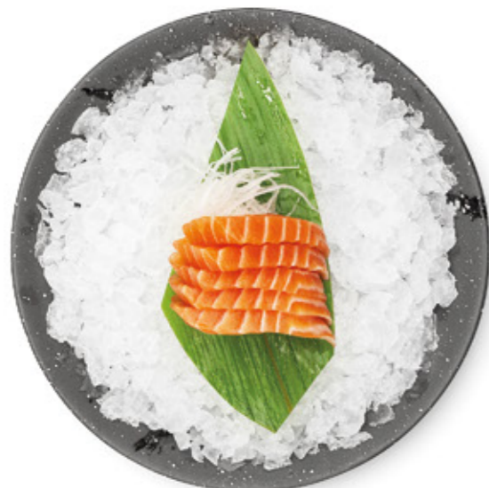
Salmon sashimi / GF / 8.5