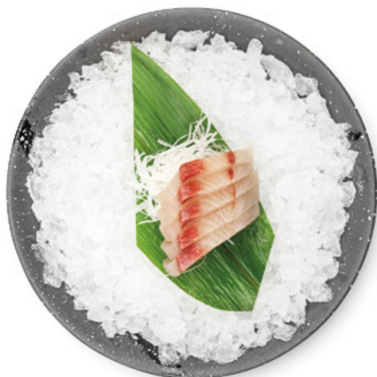
Kingfish sashimi / GF / 9