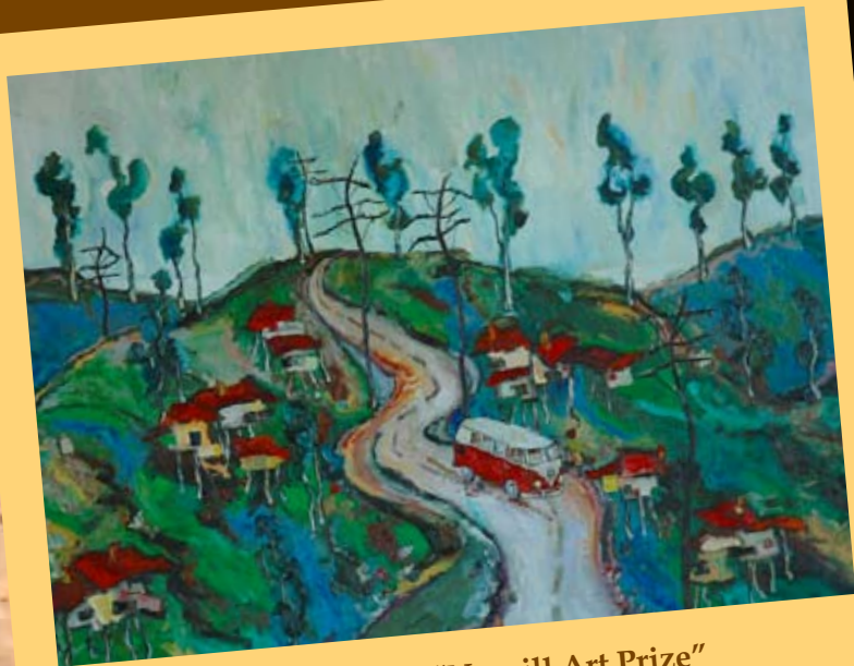
Finalist - 2010 "Norvill Art Prize"