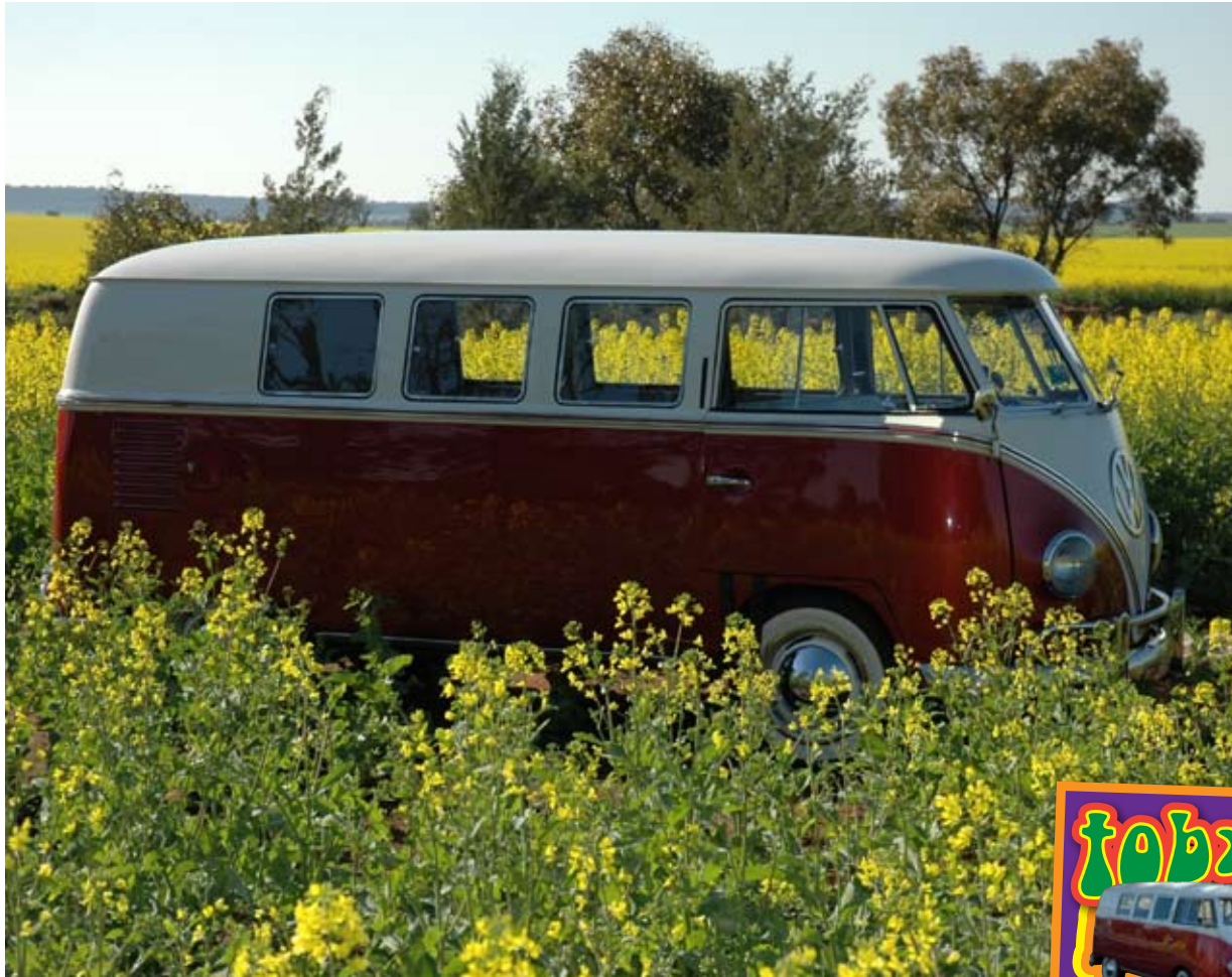
'Toby G' ... Garnish Bistro's auto mascot, a 1959 VW 'splitty' Kombi.