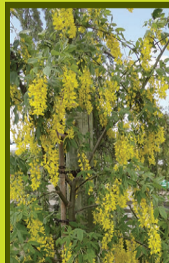
Golden chain tree Laburnum vossii striking yellow racemes adorn this showy tree, adds bright yellow to the garden and a small growing tree, great over a trellis.