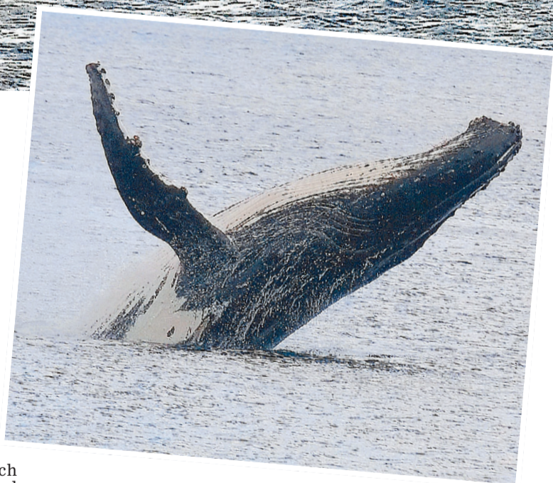
SPECTACULAR: Up to 30 whales breached off Bicheno on the East Coast on a single day and locals want to set up a warning system.

“What we are trying to do is set up a thing where we ring the church bell or set up a siren on the roof of