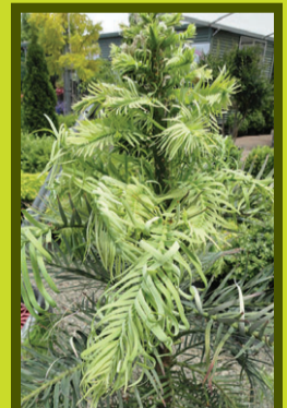
Wollemii Pine All I want for Xmas is a Wollemii pine, one of the worlds oldest plants, makes a great Christmas tree, grow in a large pot, and use it every year.

Westland nurseries carries the largest range of advance trees and shrubs in Tasmania so if you need to hide the fence or the shed quickly then come and see us.