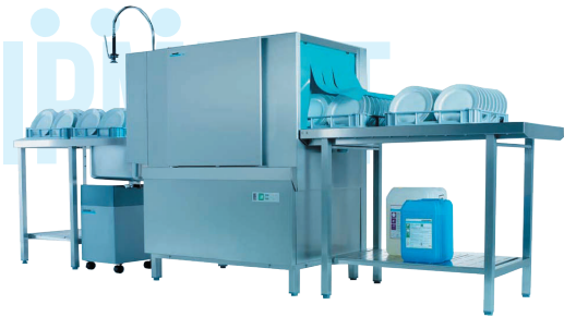
Rack Conveyor Dishwashers