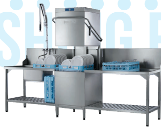
Pass Through Dishwashers