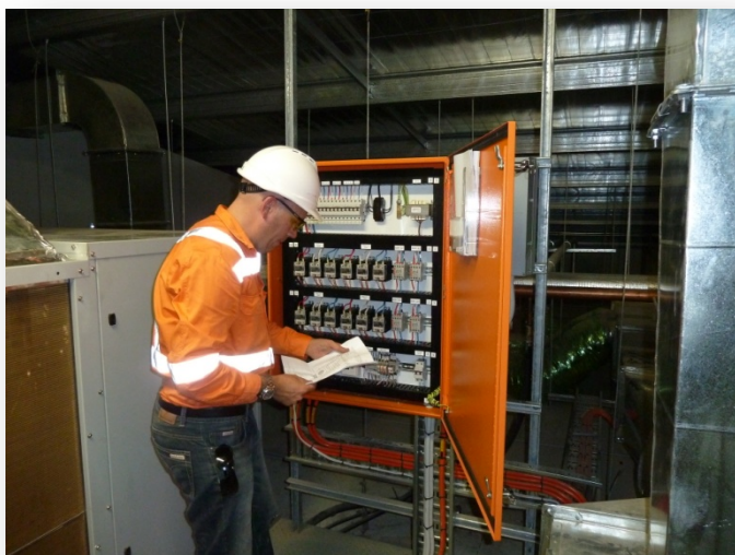
The testing & inspecting of our sub-contractors works is critical.

We have developed a system at Kaizen to ensure that all works are inspected & signed off. Through a series of newly developed test sign-off sheets, we have found this to be a critical part of sub-contractors management. We need to ensure that our sub-contractors understand that their works will be inspected & must meet a high standard.