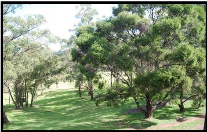
View from the Conference Hall in JKH

Conference Facilities: The Conference Hall and Sunroom, located in the Joseph Kantenich House are perfect for large group meetings. The Hall, with views across the district, seats 80-100 people in theatre style and opens into a chapel. The sunroom and adjacent kitchen is ideal for refreshment breaks but can also seat up to 35 people for small group activities. The extensive grounds also provide many opportunities for small groups to meet informally.