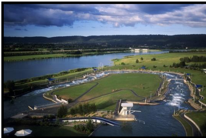
Sydney International Regatta Centre & Penrith Whitewater

It is also an ideal accommodation venue for groups competing at and visiting the Sydney International Regatta Centre and Penrith Whitewater.