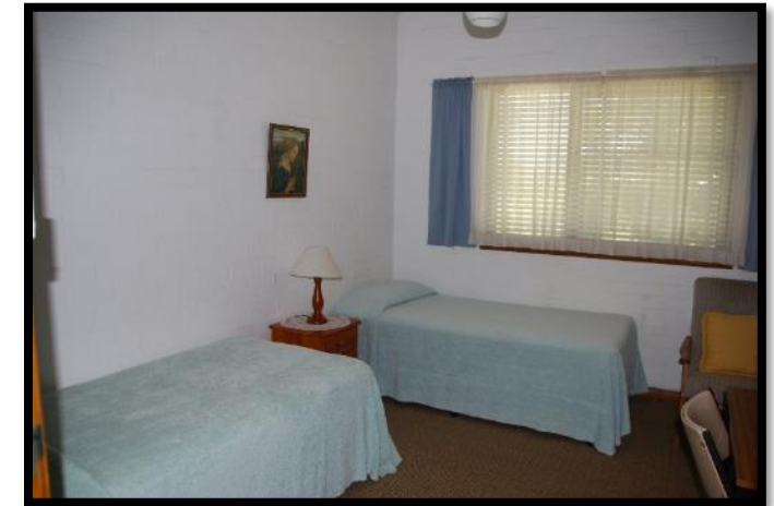
Joseph Kantenich House – Accommodation Rooms

Joseph Kantenich House provides catered accommodation for up to 42 people. With a total of 18 rooms, most are configured with 2 beds and private ensuite. We have two sets of rooms, sharing bathroom facilities that sleep up to six and are perfect for a family getaway.