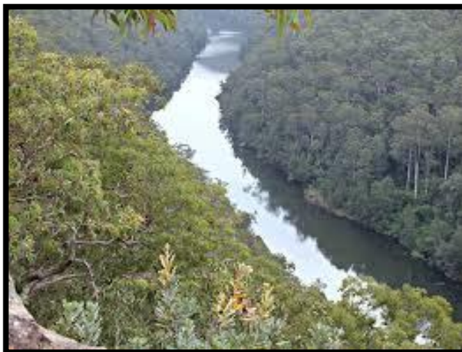
The Rock Lookout, at the end of Fairlight Road

Mount Schoenstatt is a short car trip from the World Heritage listed Blue Mountains, the Nepean River, Warragamba Dam, the source of Sydney's water supply and the historic village of Mulgoa, one of the earliest settlements in Australia.