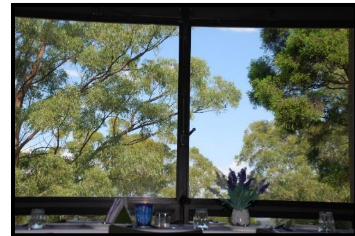
View from the Dining Room in Joseph Kantenich House

Our dining room pictured below, boasts rural valley views, a most tranquil room to enjoy a retreat meal. Whether catering for a couple, small group or larger group our staff will endeavor to look after you during your stay with us.