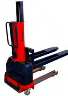
Innolift - Red