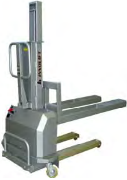
Innolift - Silver