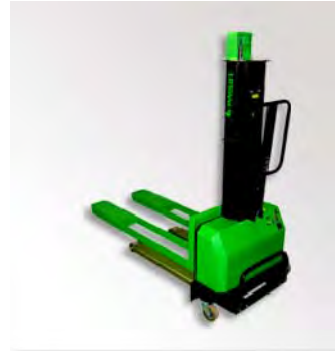
Electrical # A600950