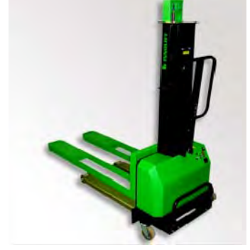
Electrical # A5001200 Email to