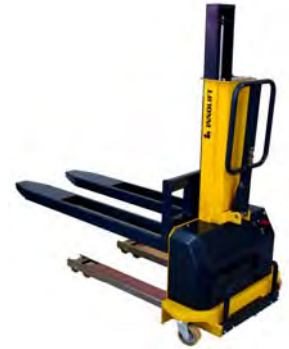
Innolift - Yellow