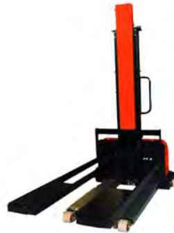
Innolift - Orange