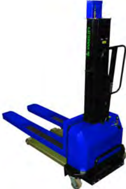
Innolift - Blue