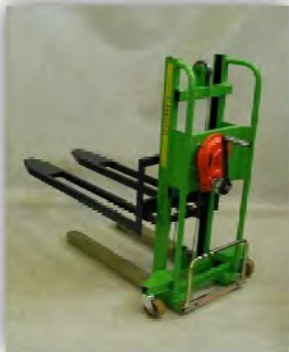
Manual # 300650V