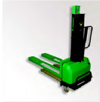
Electrical # A600750